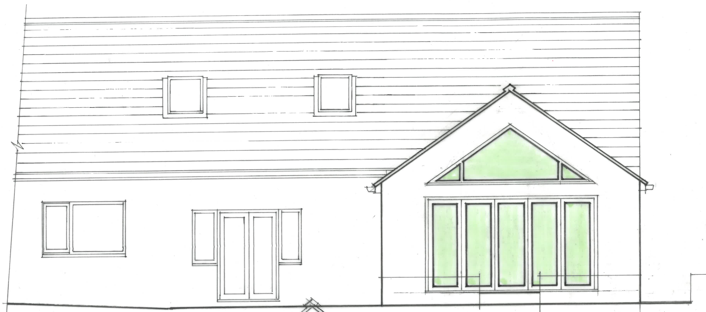
PART REAR ELEVATION