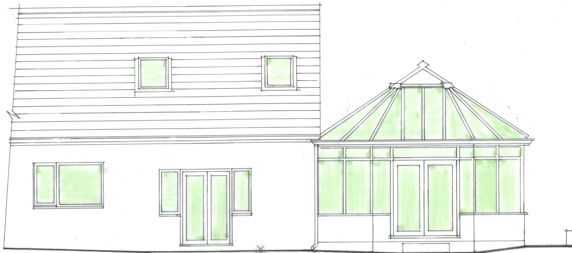
PART REAR ELEVATION