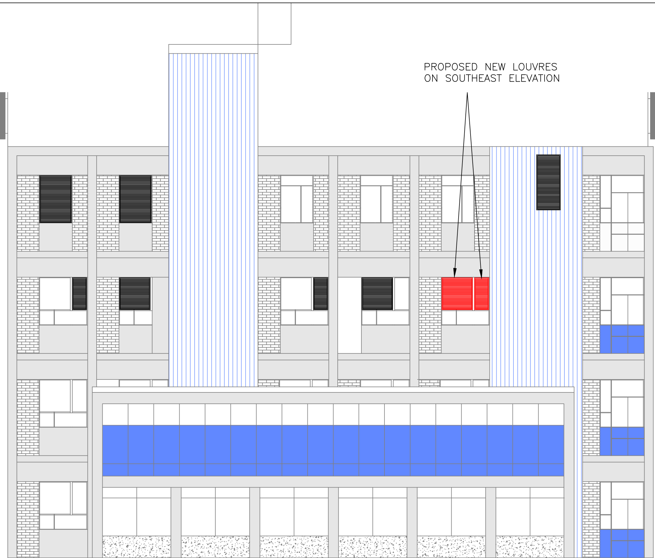
PROPOSED SOUTHEAST ELEVATION (1:100)