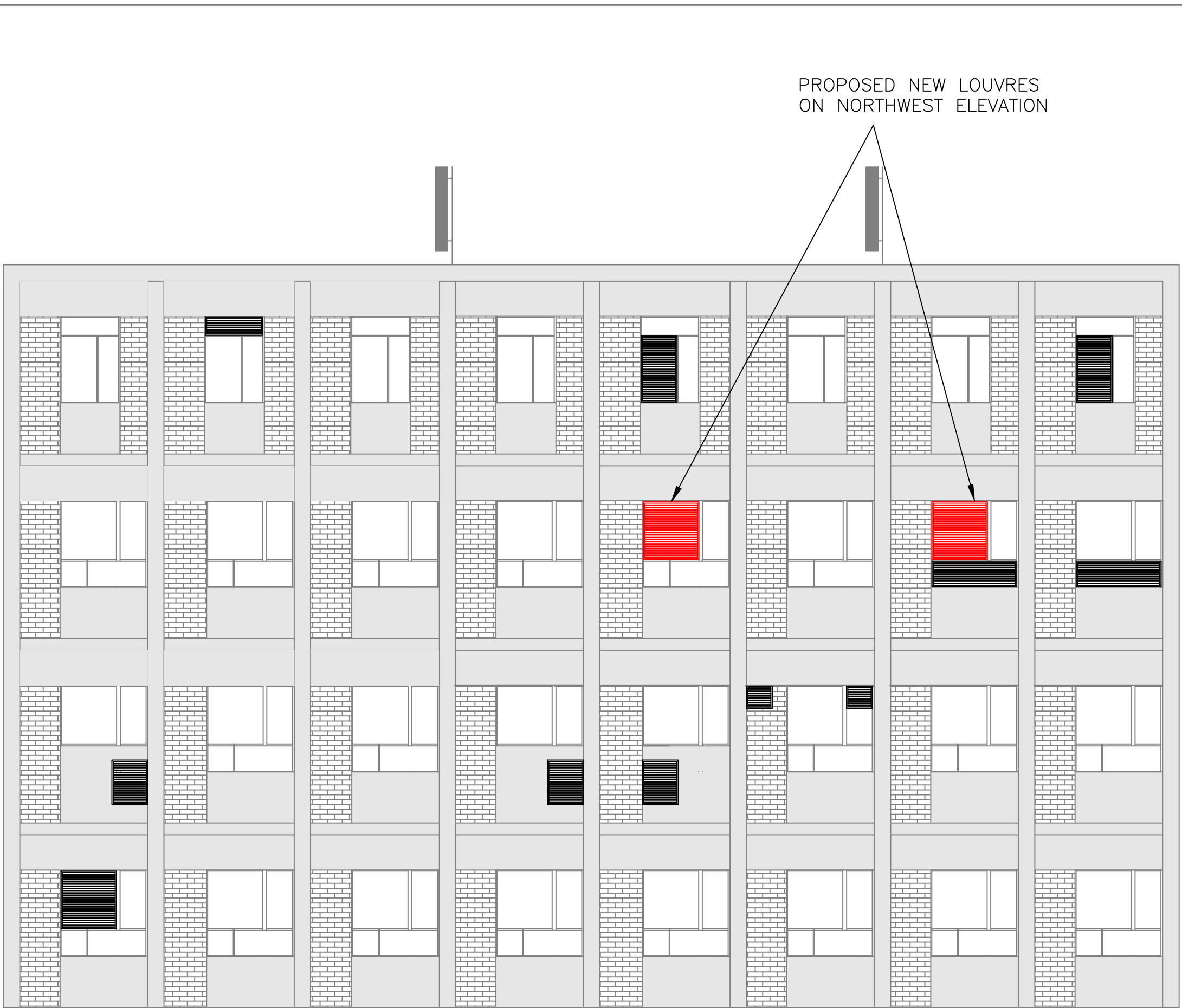
PROPOSED NORTHWEST ELEVATION (1:100)