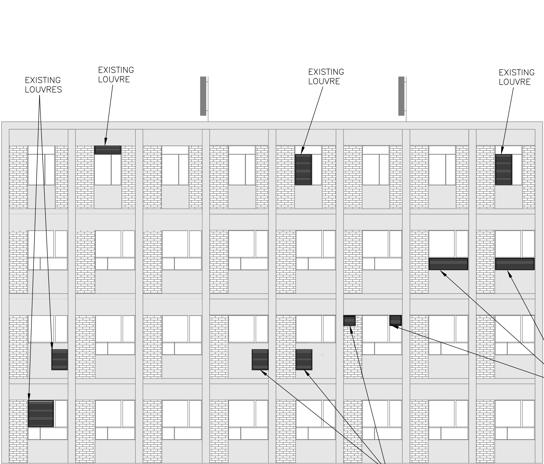
EXISTING NORTHWEST ELEVATION (1:100)