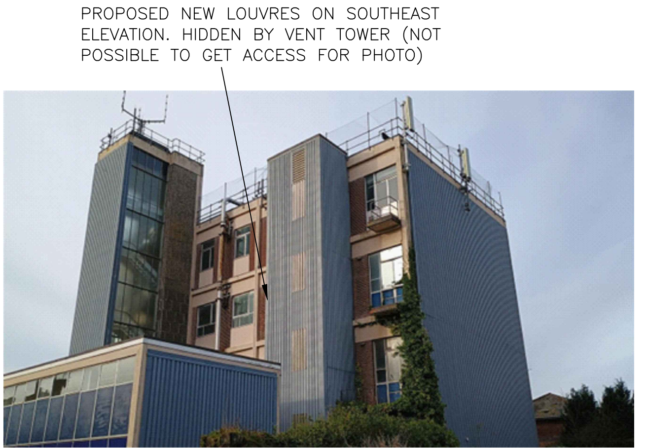
PHOTO OF SOUTHEAST ELEVATION