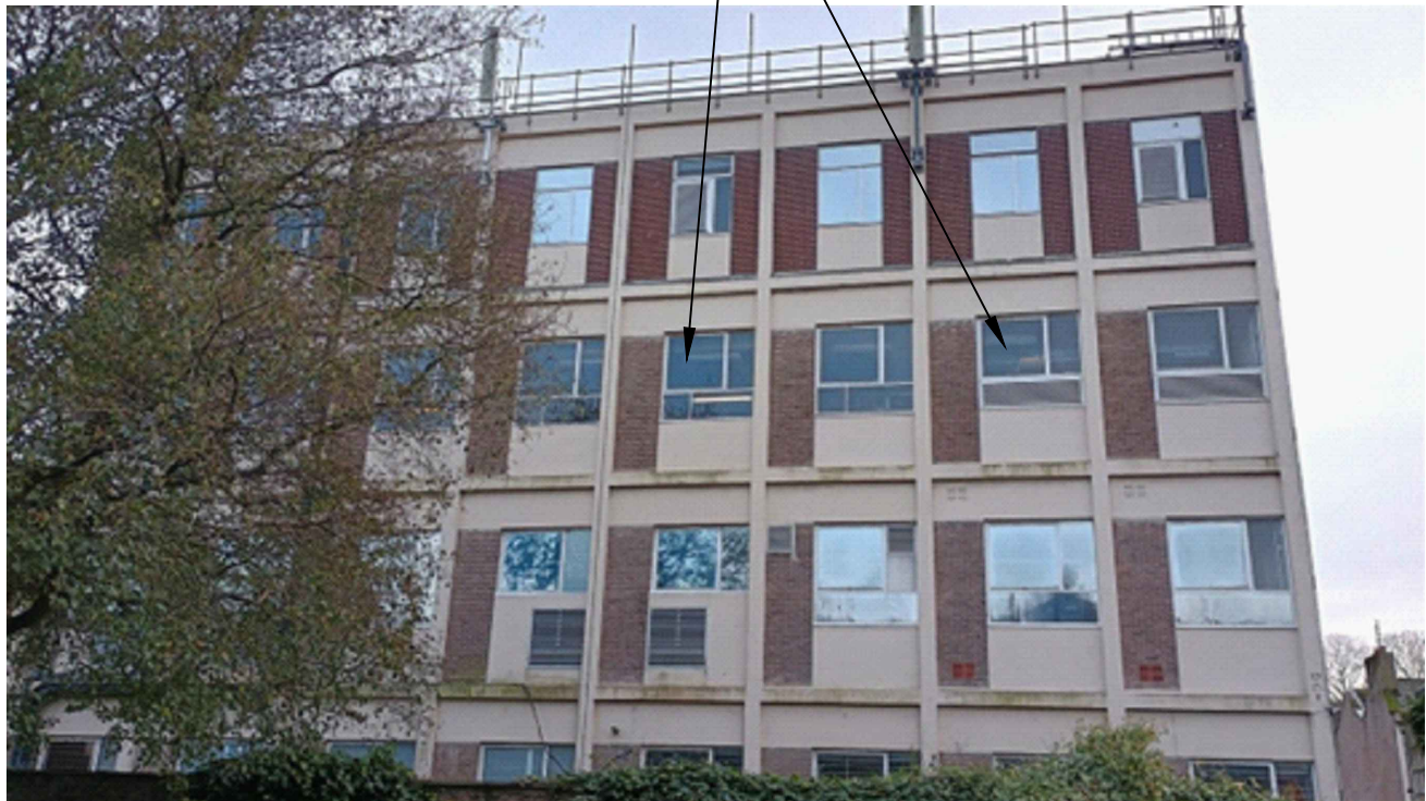
PHOTO OF NORTHWEST ELEVATION