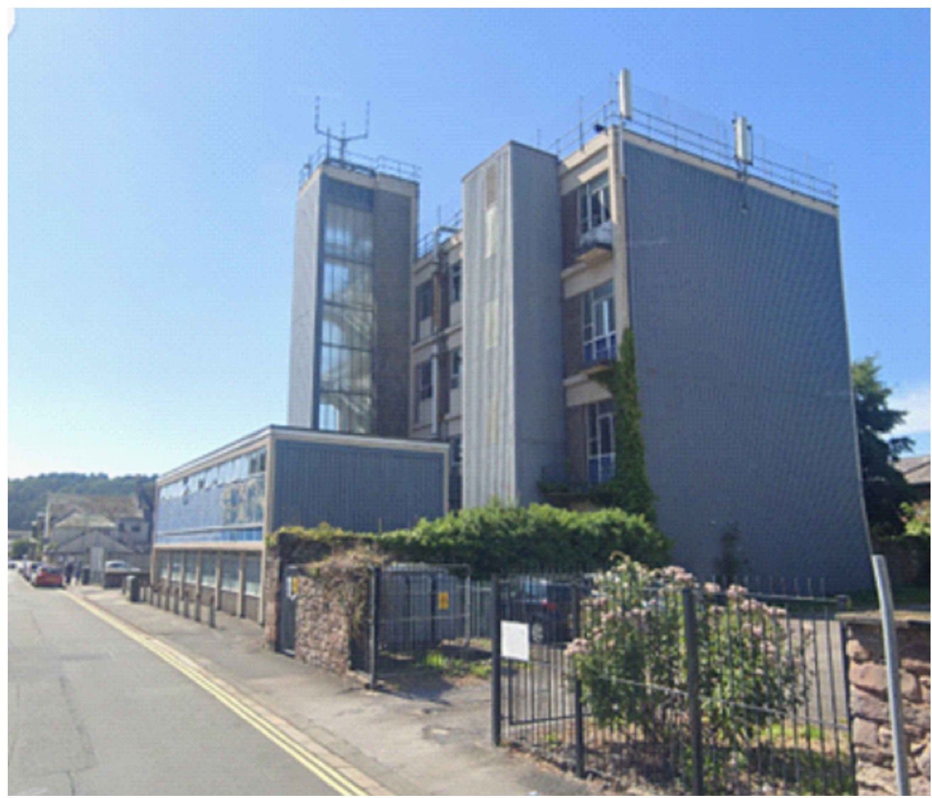
PHOTO OF SOUTHEAST ELEVATION