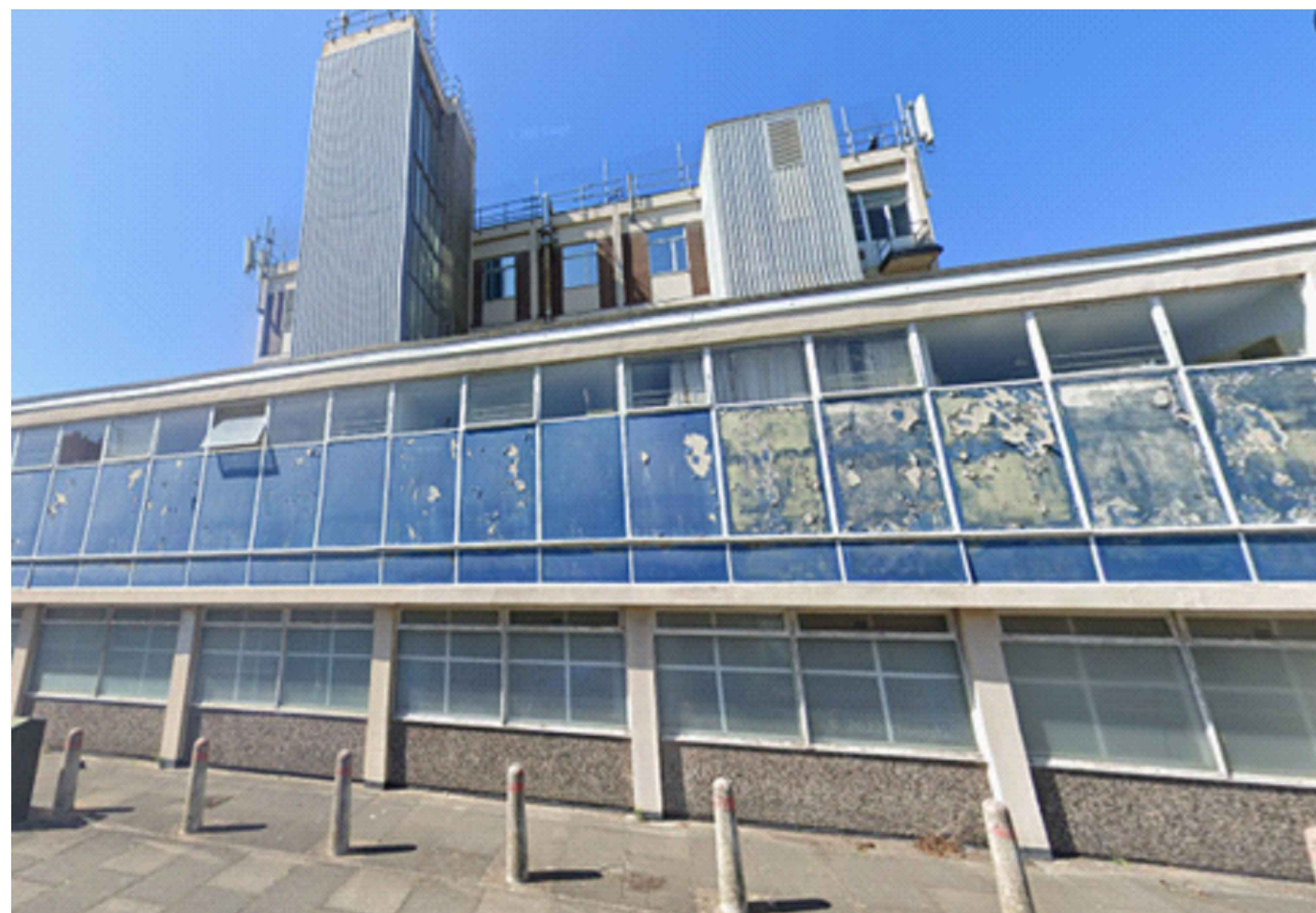
PHOTO OF SOUTHEAST ELEVATION