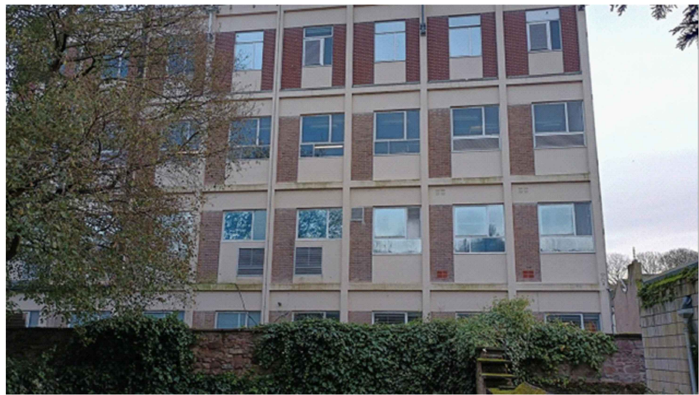
PHOTO OF NORTHWEST ELEVATION