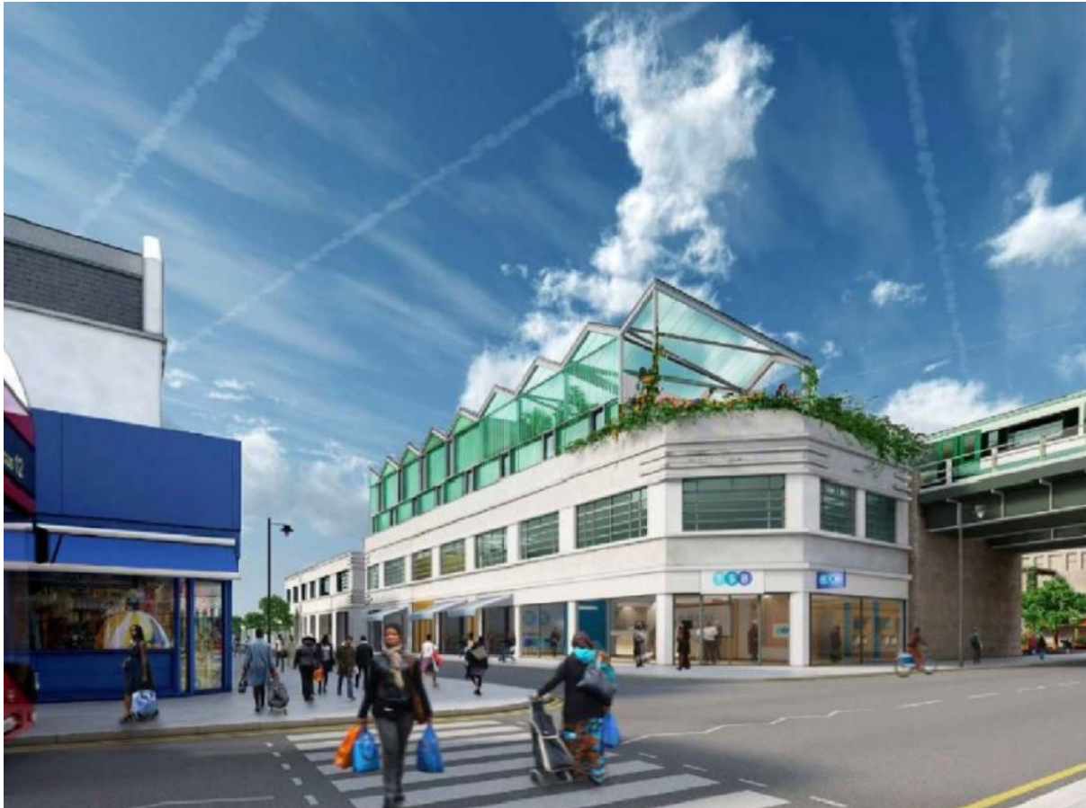
3D Visuals of the new Shopfront

For additional details, please refer to the External Elevation on the Whitehaven 610 CP Workbook 2021.04.13 Document.