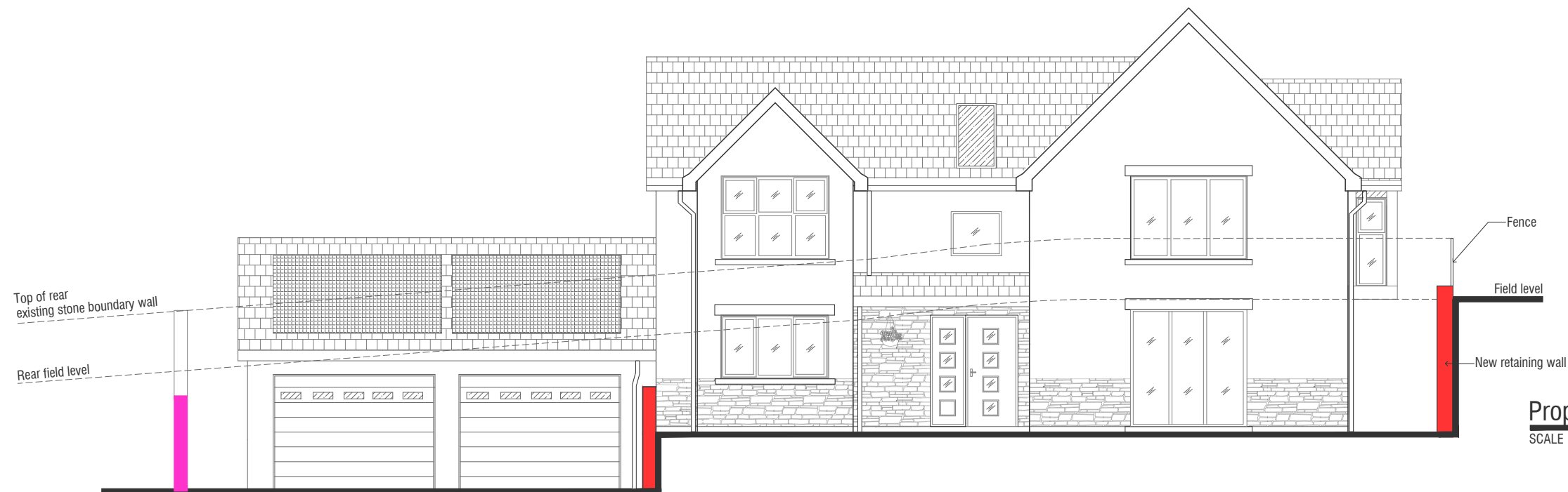
Proposed Front/South East Facing Elevation SCALE 1:100@A3