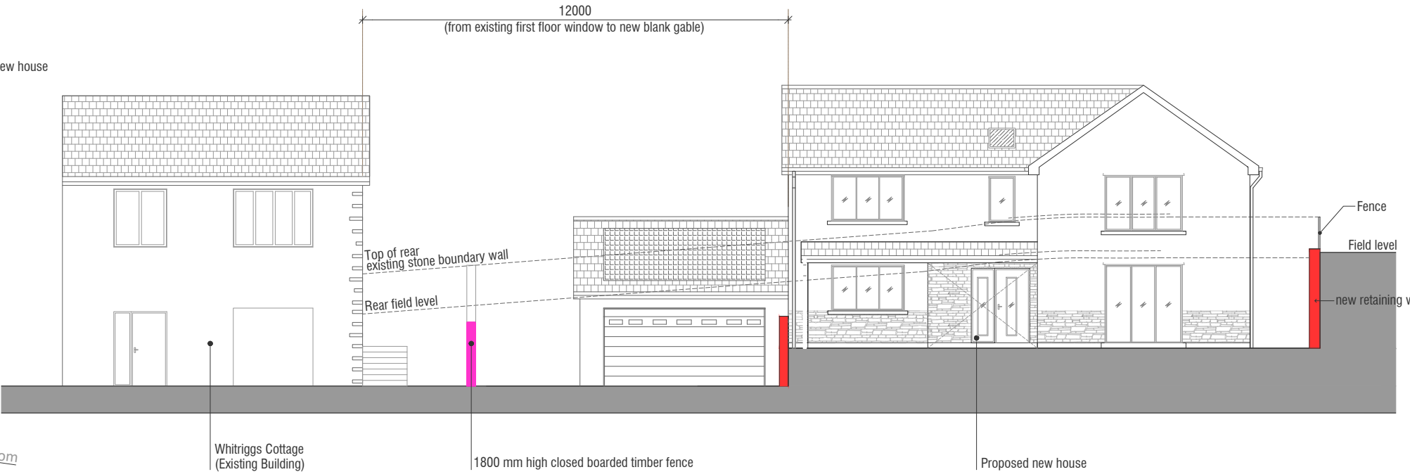
Proposed site section B-B SCALE 1:150@A3