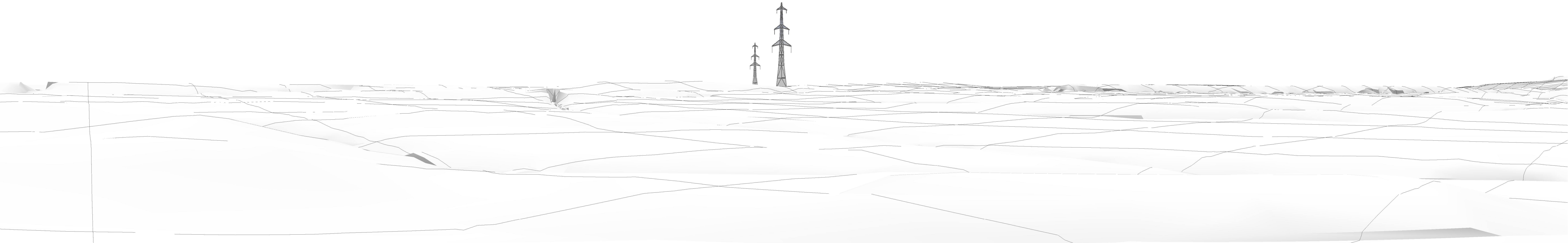
Existing Wireline View - 90° Field of View, Cylindrical Projection