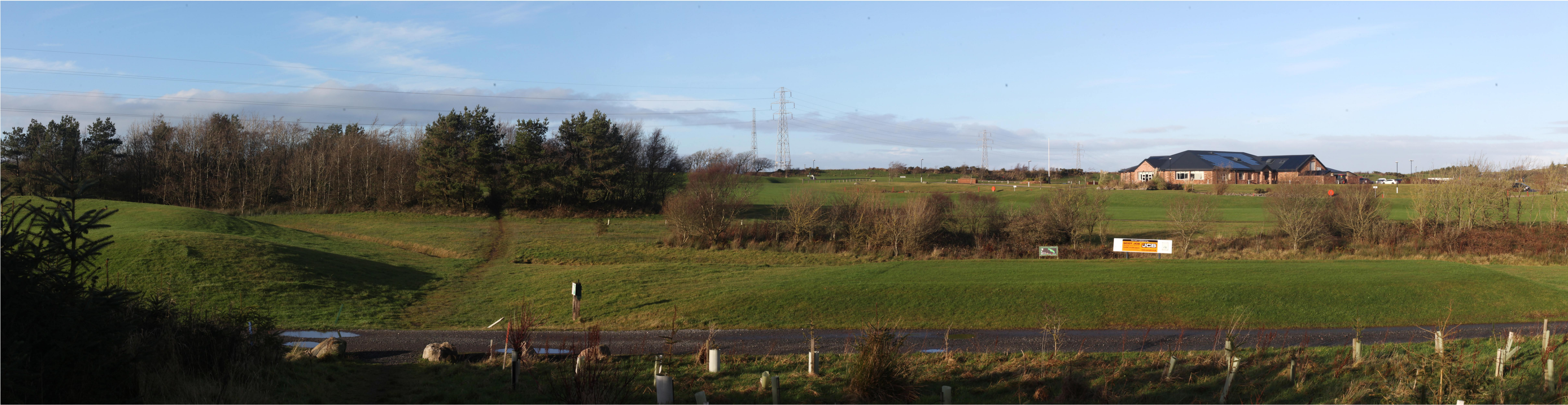
Existing View - 90° Field of View, Cylindrical Panorama (with 50mm fixed Focal Length)