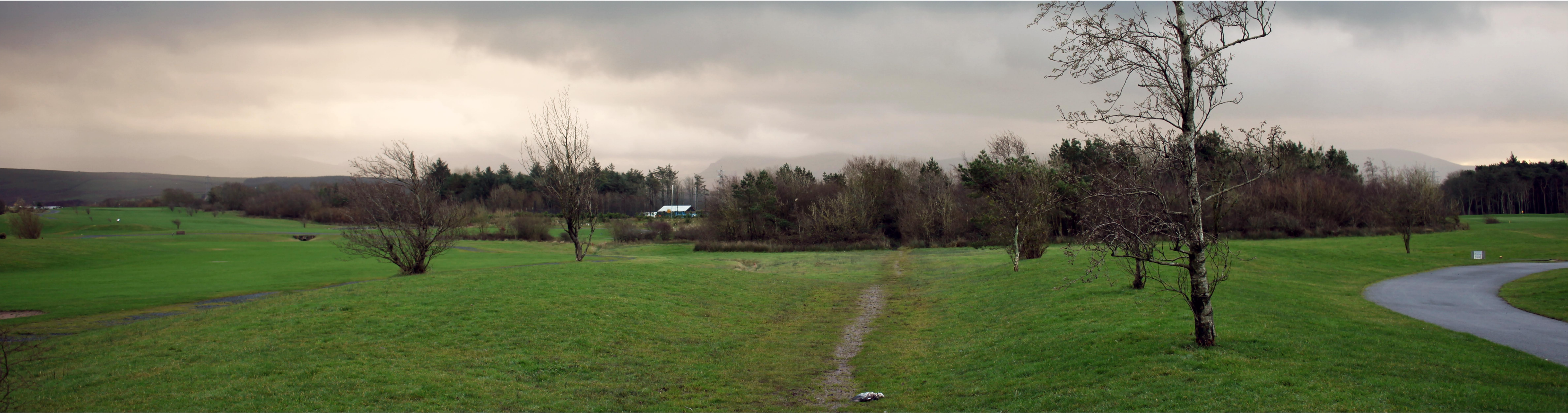
Existing View - 64.7° Field of View, Planar Projection (28mm fixed Focal Length)