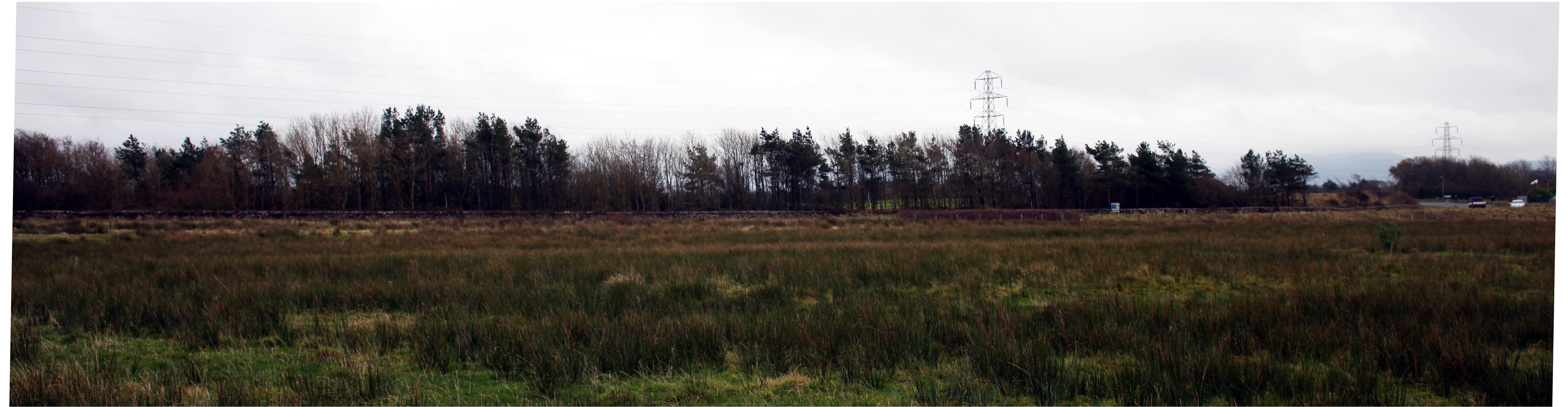
Existing View - 64.7° Field of View, Planar Projection (28mm fixed Focal Length)