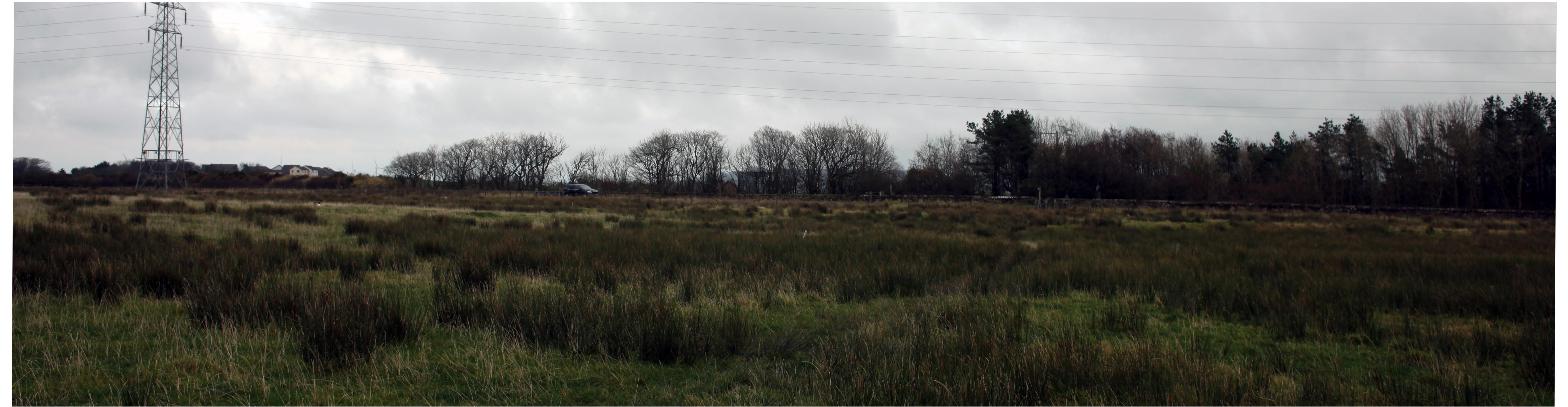
Existing View - 64.7° Field of View, Planar Projection (28mm fixed Focal Length)