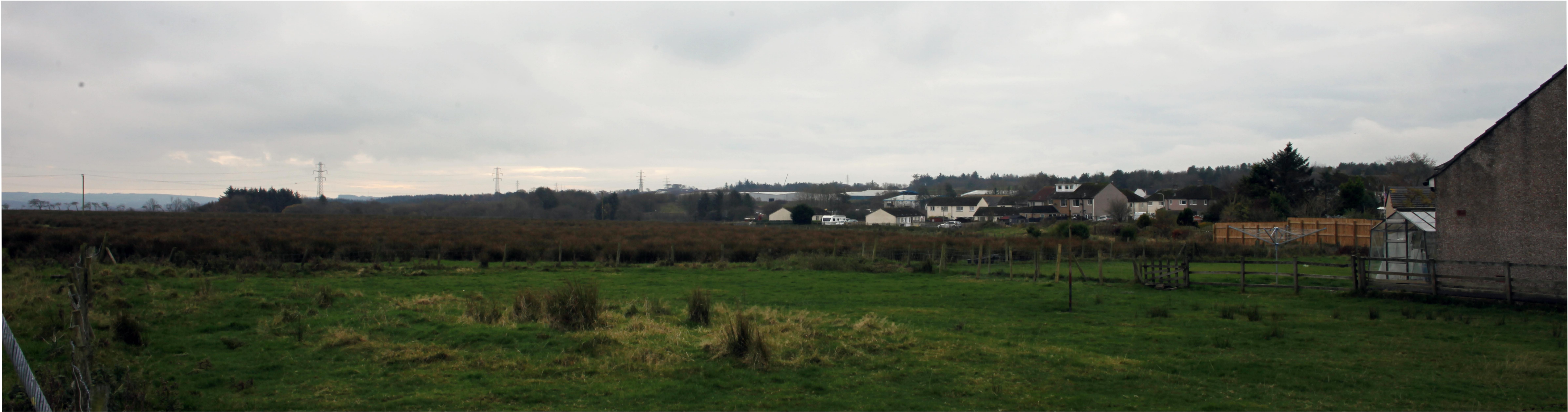
Existing View - 64.7° Field of View, Planar Projection (28mm fixed Focal Length)