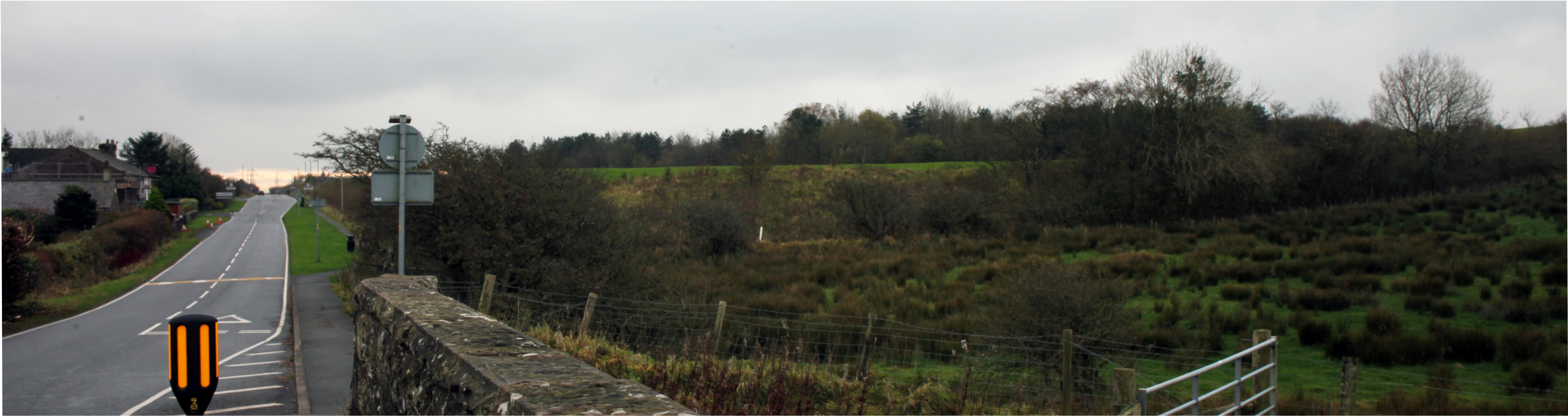
Existing View - 64.0° Field of View, Planar Projection (28mm fixed Focal Length)