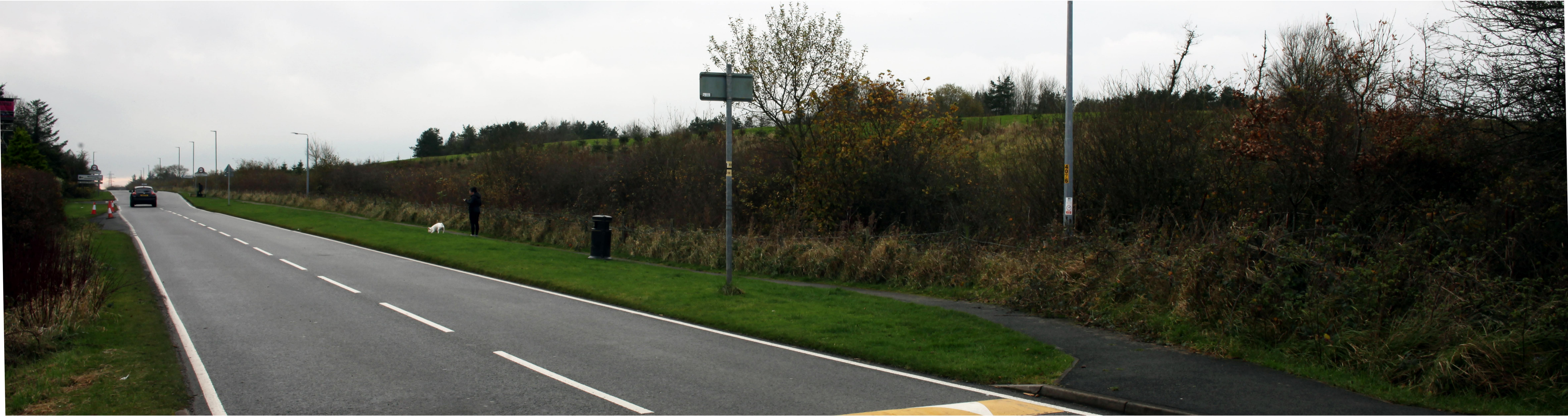
Existing View - 64.0° Field of View, Planar Projection (28mm fixed Focal Length)