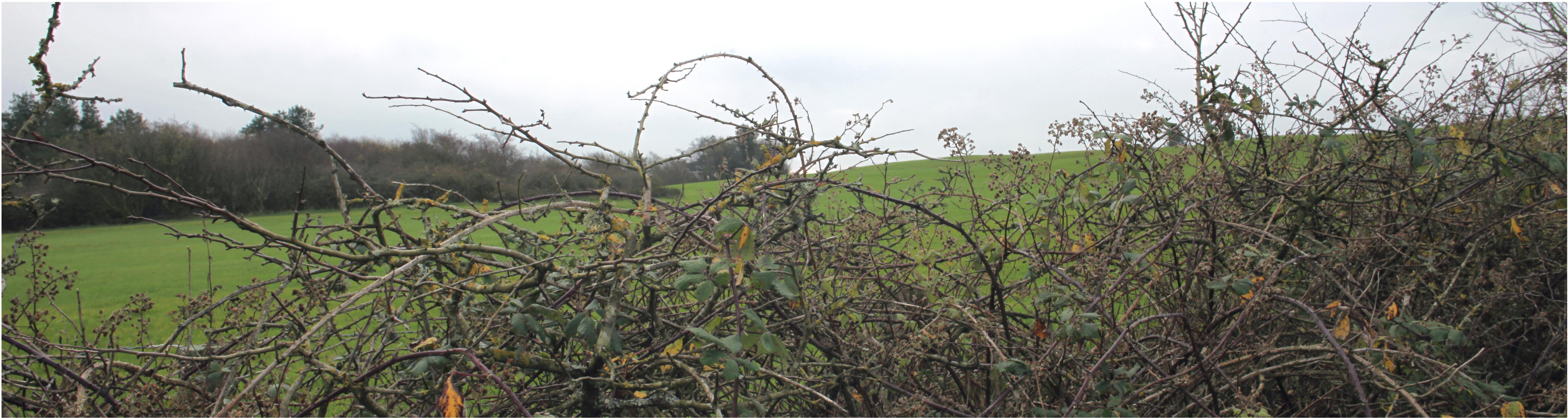
Existing View - 64.0° Field of View, Planar Projection (28mm fixed Focal Length)