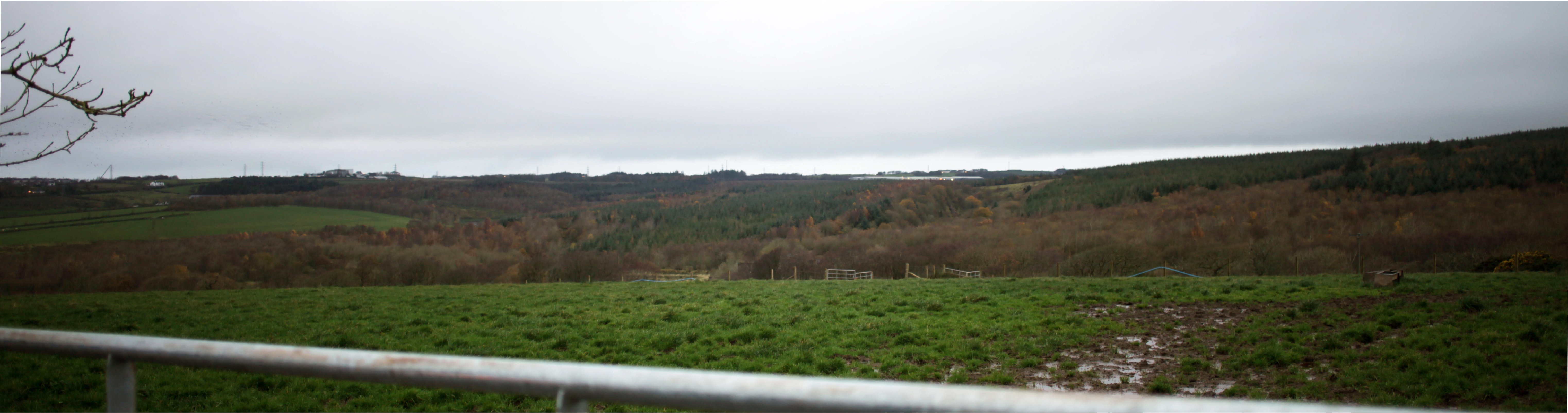
Existing View - 64.7° Field of View, Planar Projection (28mm fixed Focal Length)