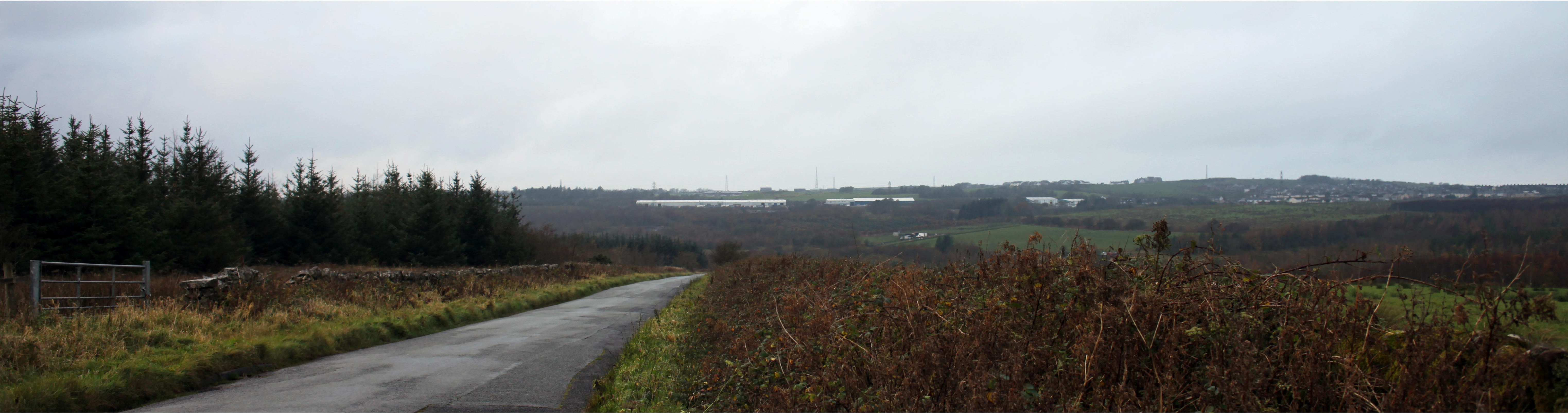
Existing View - 64.7° Field of View, Planar Projection (28mm fixed Focal Length)