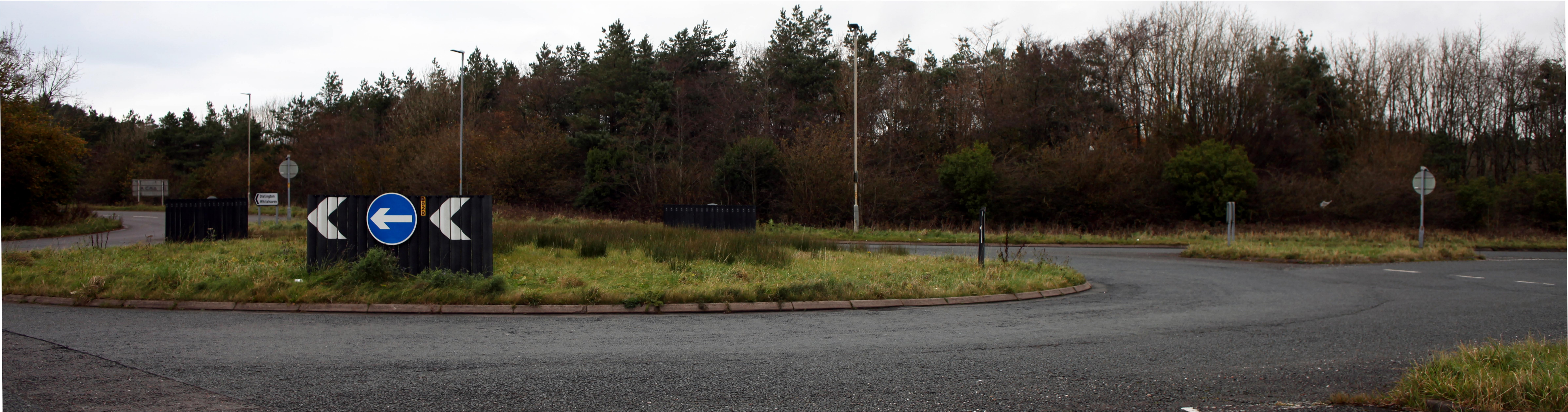
Existing View - 64.7° Field of View, Planar Projection (28mm fixed Focal Length)