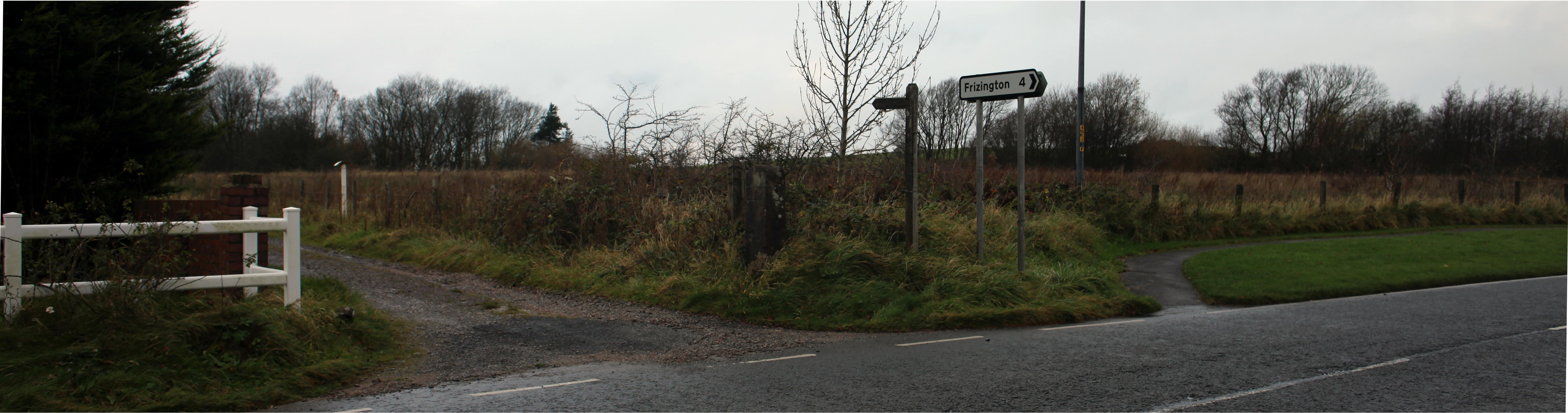
Existing View - 64.7° Field of View, Planar Projection (28mm fixed Focal Length)