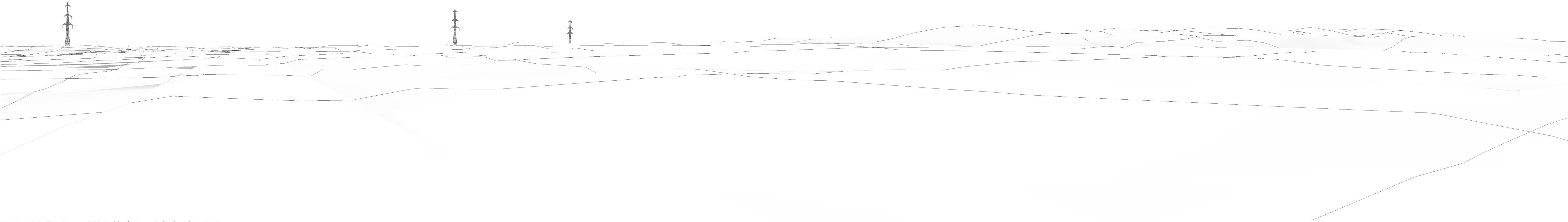
Existing Wireline View - 90° Field of View, Cylindrical Projection