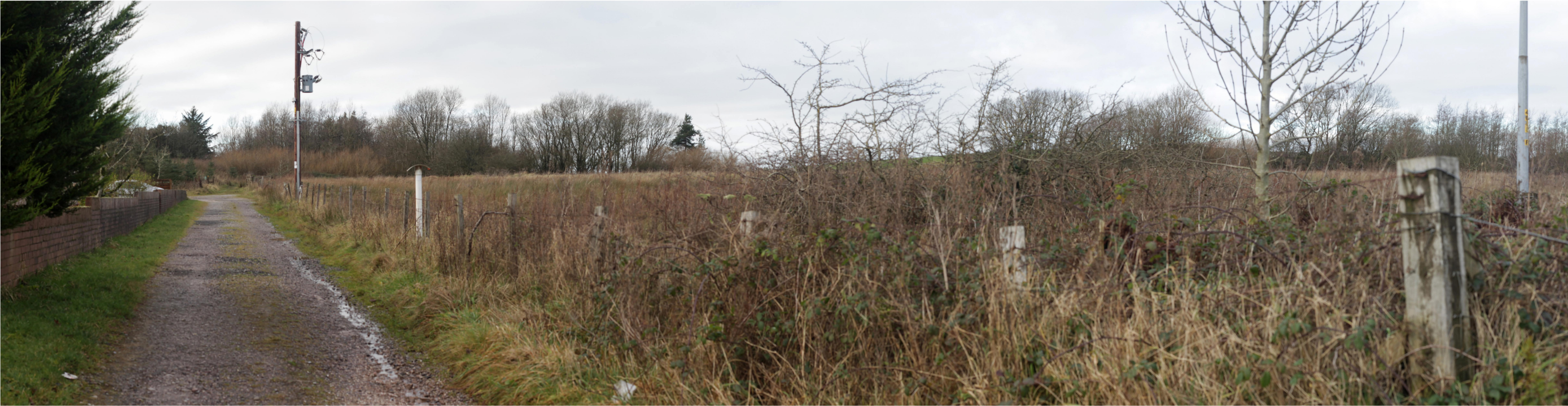
Existing View - 90° Field of View, Cylindrical Panorama (with 50mm fixed Focal Length)