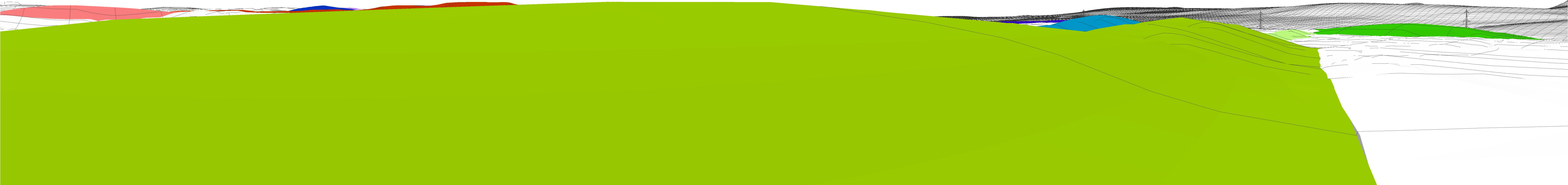
Proposed View - 90° Field of View, Cylindrical Projection