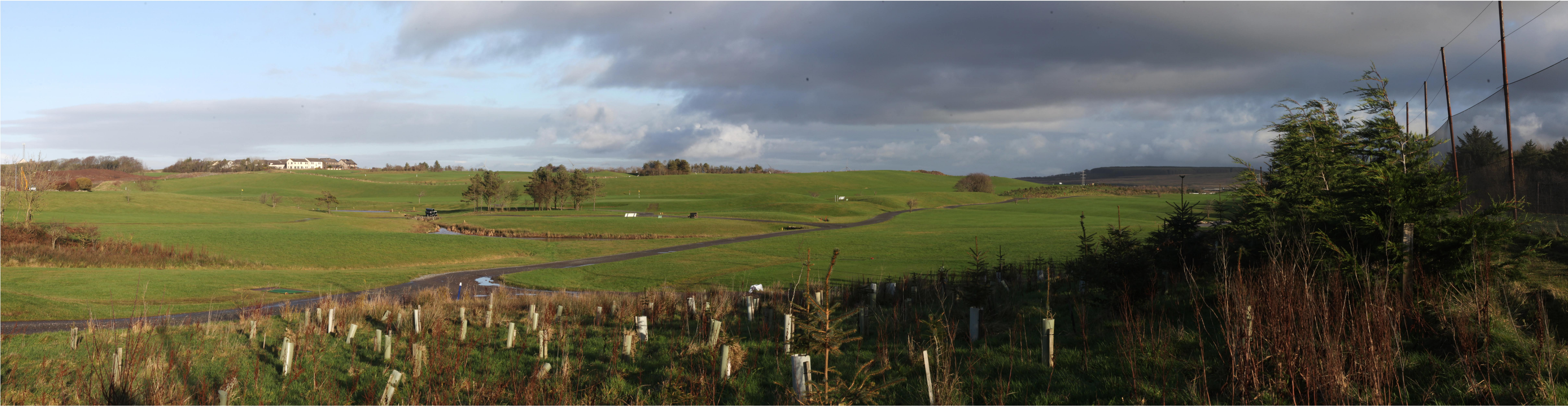
Existing View - 90° Field of View, Cylindrical Panorama (with 50mm fixed Focal Length)