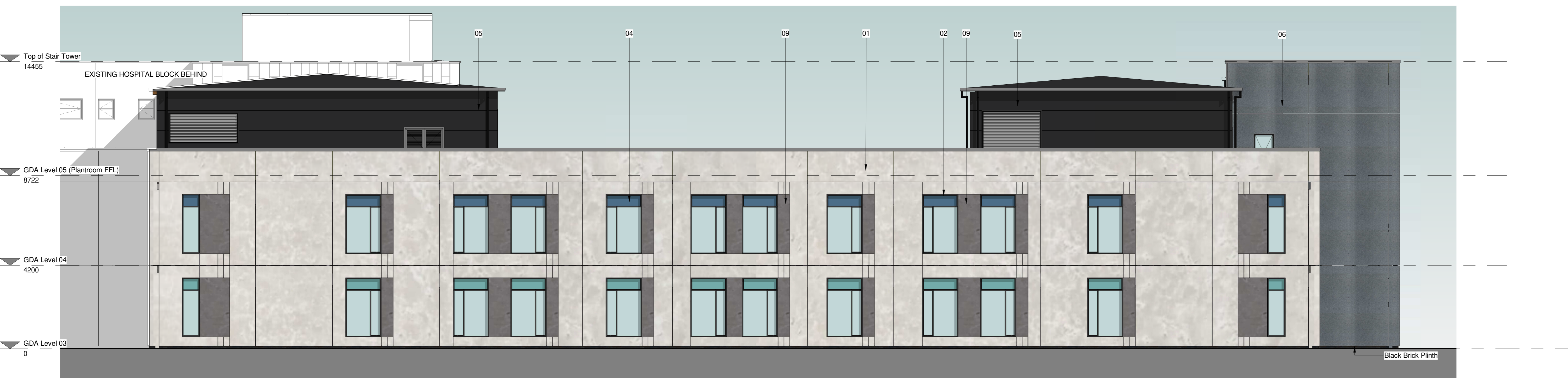
2 Elevation B 1 : 100