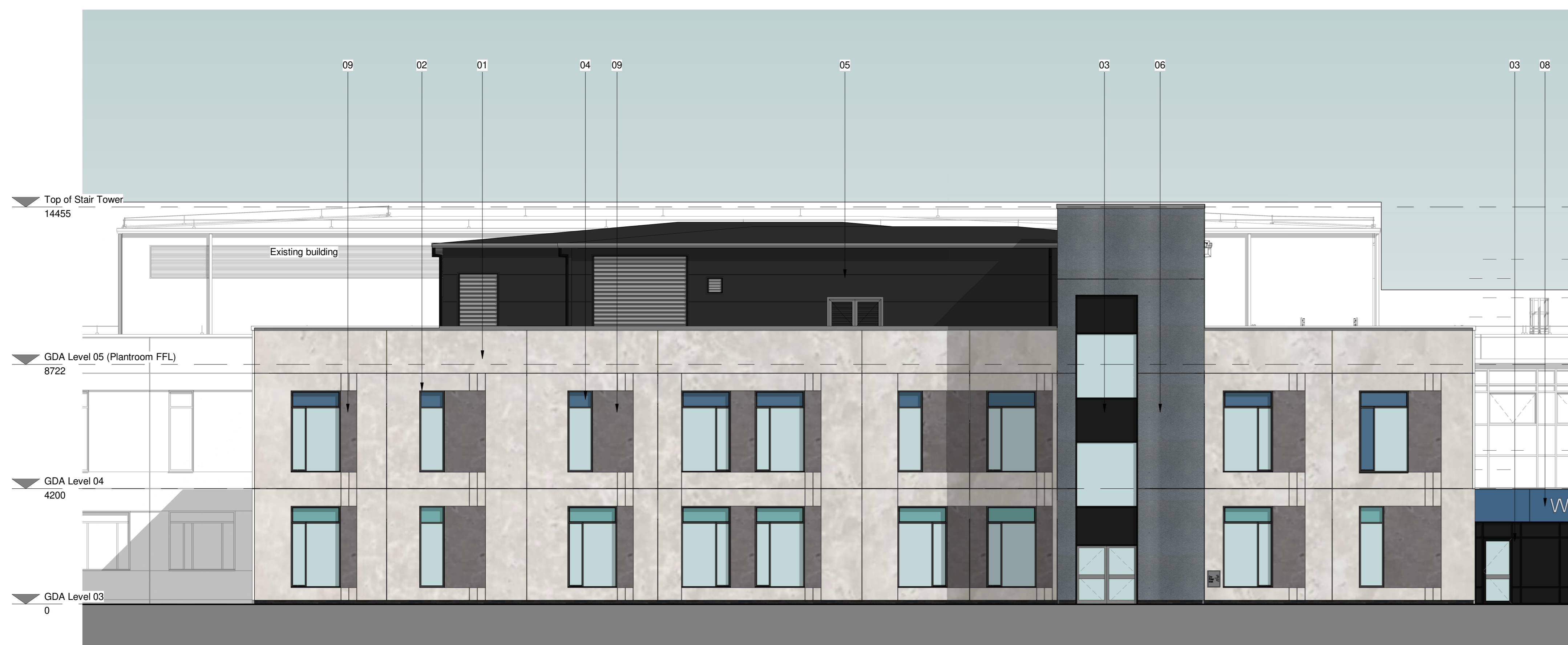
3 Elevation C 1 : 100

THIS DRAWING (OR ANY PART THEREOF) MAY NOT BE COPIED, TRANSMITTED OR DISCLOSED TO ANY THIRD PARTY OR UNAUTHORISED PERSON WITHOUT THE PRIOR WRITTEN PERMISSION OF GILLING DOD ARCHITECTS. THIS DRAWING IS TO BE READ IN CONJUNCTION WITH ALL OTHER RELEVANT DRAWINGS PREPARED BY CONSULTANTS AND SUB-CONTRACTORS. REPORT ANY DISCREPANCIES TO THE ARCHITECT OR REPRESENTATIVES THEREOF. © ALL RIGHTS RESERVED. NO PART OF THIS DRAWING MAY BE REPRODUCED OR TRANSMITTED IN ANY FORM OR BY ANY MEANS WITHOUT THE WRITTEN PERMISSIONS OF THE COPYRIGHT HOLDER. ONCE PRINTED AND DISTRIBUTED THIS DOCUMENT IS ASSUMED UNCONTROLLED. DO NOT SCALE FROM THIS DRAWING. WORK ONLY TO PRINTED DIMENSIONS. 1 0 1 2 3 4 5 SCALE 1: 100 m