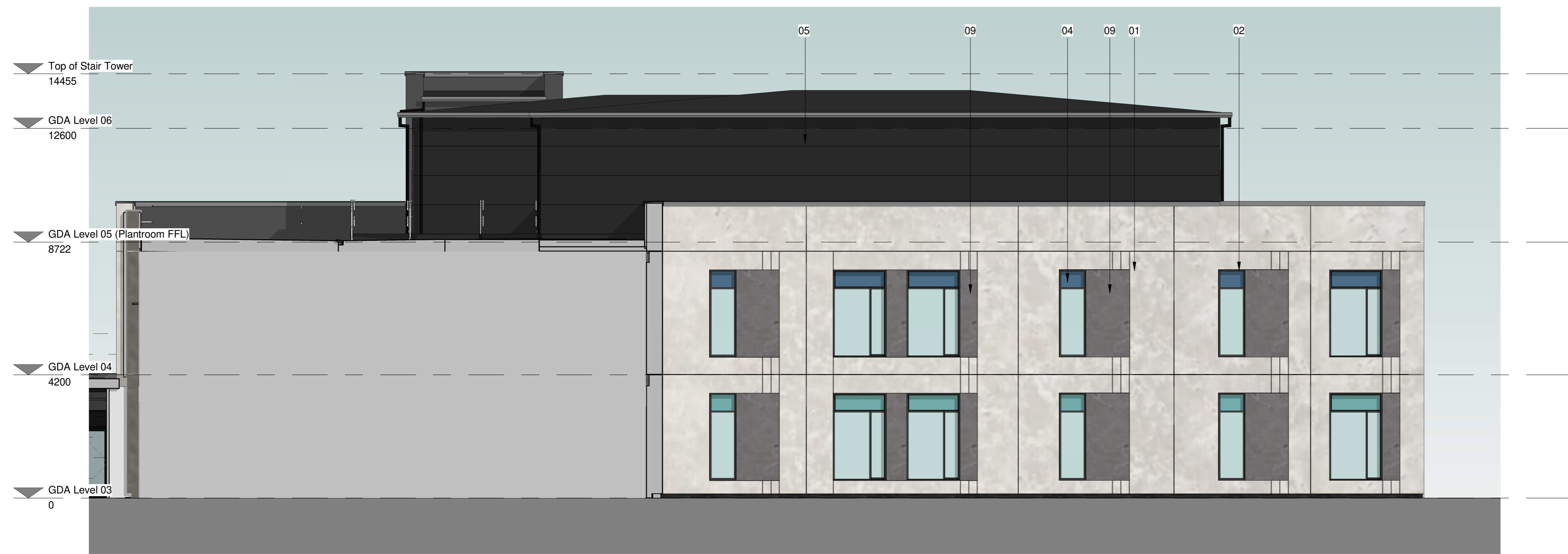
1 Elevation A 1 : 100