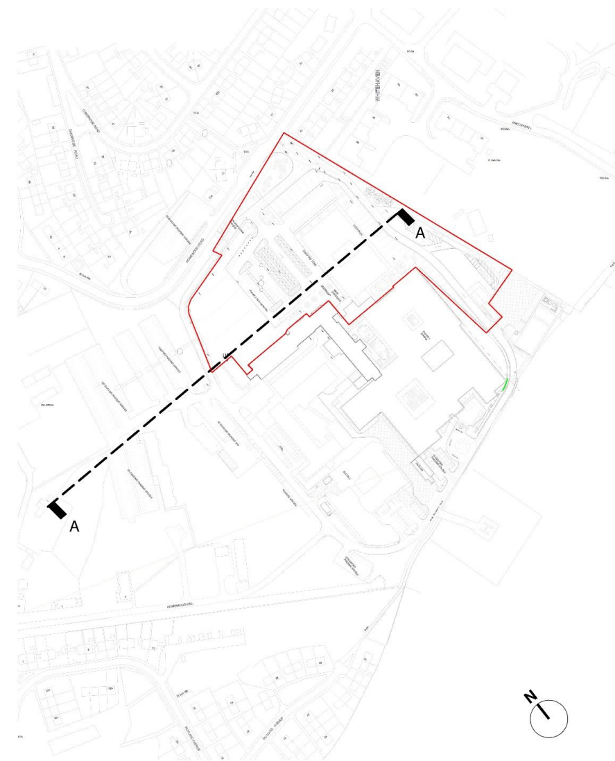
2 Site Reference Plan 1 : 1250

THIS DRAWING (OR ANY PART THEREOF) MAY NOT BE COPIED, TRANSMITTED OR DISCLOSED TO ANY THIRD PARTY OR UNAUTHORISED PERSON WITHOUT THE PRIOR WRITTEN PERMISSION OF GILLING DOD ARCHITECTS. THIS DRAWING IS TO BE READ IN CONJUNCTION WITH ALL OTHER RELEVANT DRAWINGS PREPARED BY CONSULTANTS AND SUB-CONTRACTORS. REPORT ANY DISCREPANCIES TO THE ARCHITECT OR REPRESENTATIVES THEREOF. © ALL RIGHTS RESERVED. NO PART OF THIS DRAWING MAY BE REPRODUCED OR TRANSMITTED IN ANY FORM OR BY ANY MEANS WITHOUT THE WRITTEN PERMISSIONS OF THE COPYRIGHT HOLDER. ONCE PRINTED AND DISTRIBUTED THIS DOCUMENT IS ASSUMED UNCONTROLLED. DO NOT SCALE FROM THIS DRAWING. WORK ONLY TO PRINTED DIMENSIONS. 0.5 1 2 2.5 m SCALE: 1:50 Site Boundary