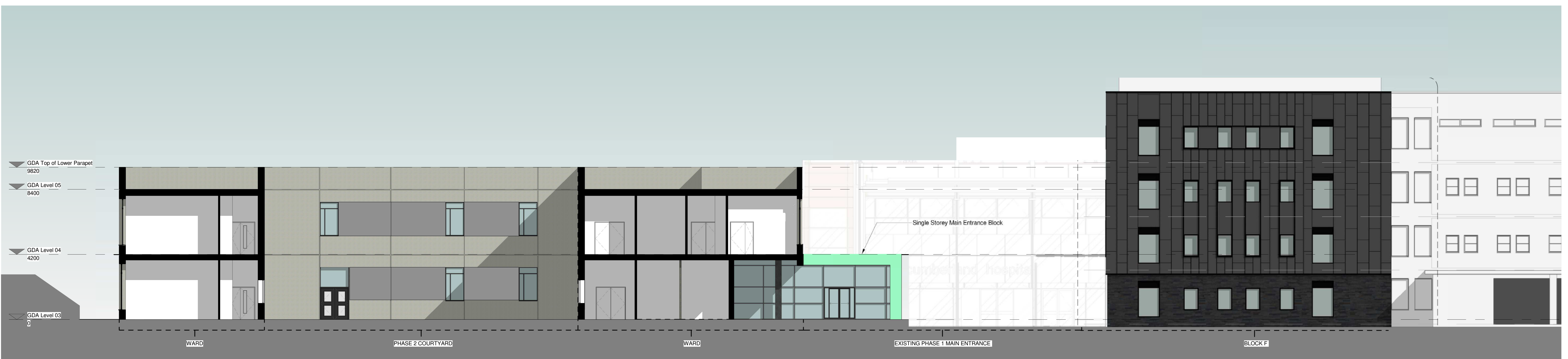
3 Elevation E 1 : 100