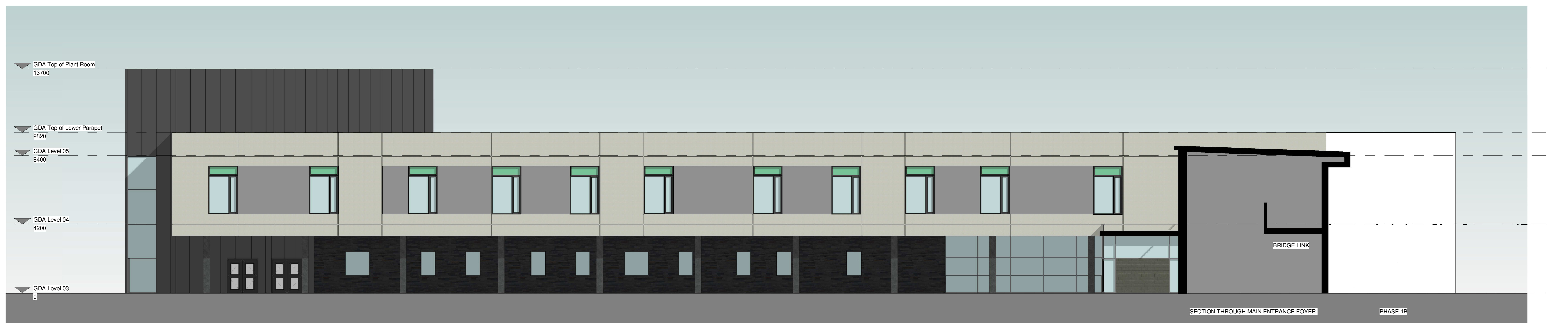
4 Elevation D 1 : 100