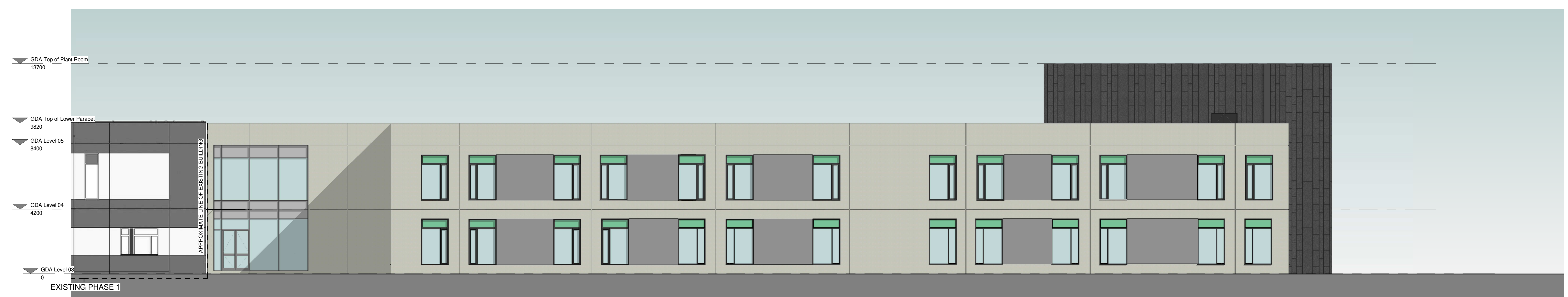
2 Elevation B 1 : 100