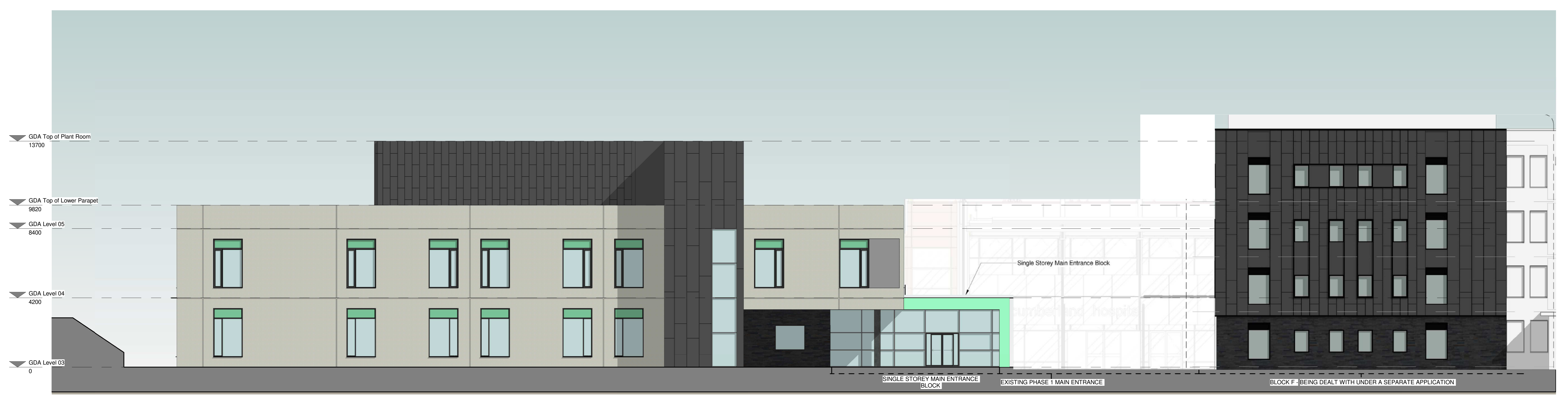
3 Elevation C 1 : 100