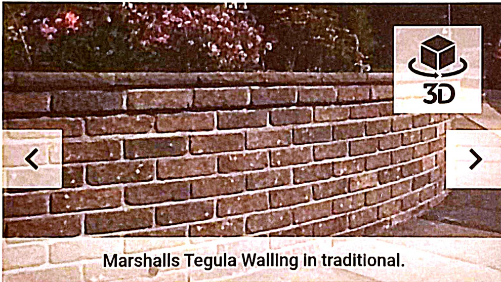
Marshalls Tegula Walling in traditional.

For items in stock, order now for delivery from Friday 6th January