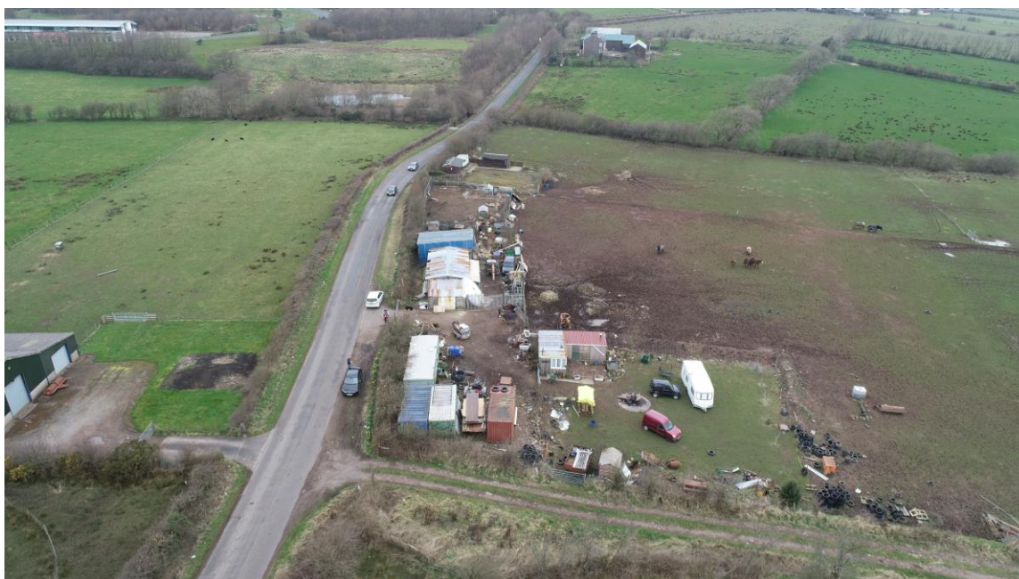
Fig 1 – Google Earth Pro – 10/2008 (Aerial View) - 16 years ago