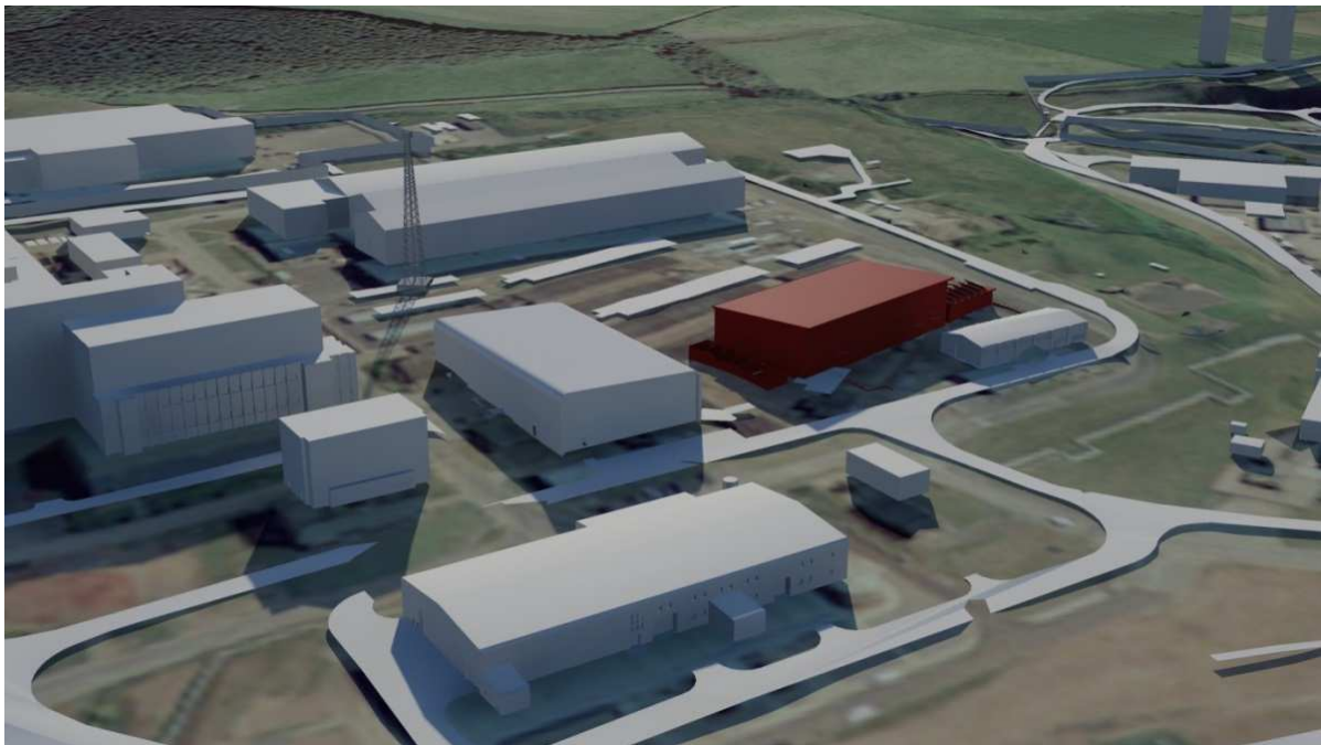
Image 1 Site Aerial View

The purpose of the document is to illustrate the visual impact of the proposed CNC Operational Unit from several key locations external to the Sellafield site. The study does not consider any existing foliage which may further impede the view of the proposed building. The proposed building is highlighted in red only for illustration only. The proposed building will blend amongst the existing buildings with similar materials and colours (mid- light grey metal cladding). Please refer to drawings 3035271 & 3035272 for full elevation details.