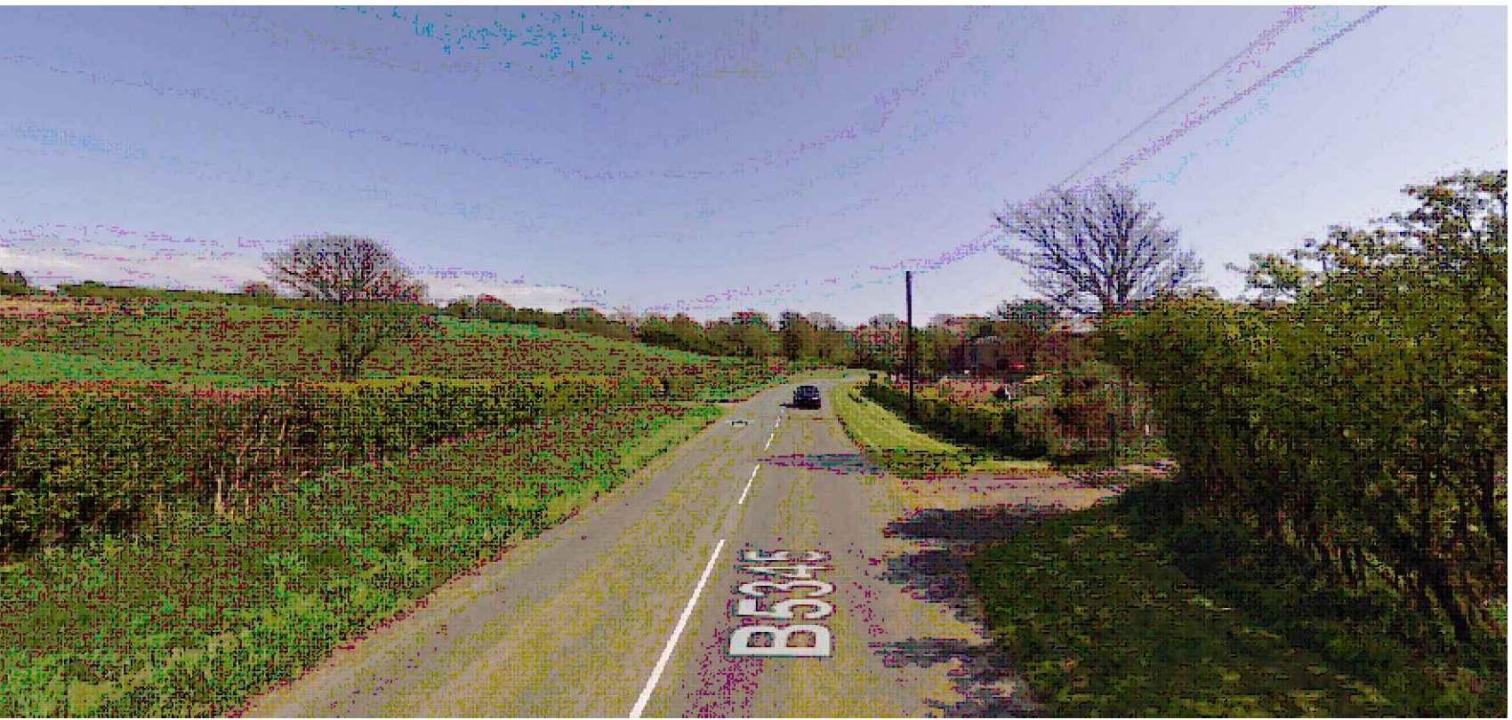
P2 - Visibility of access road facing Southeast.