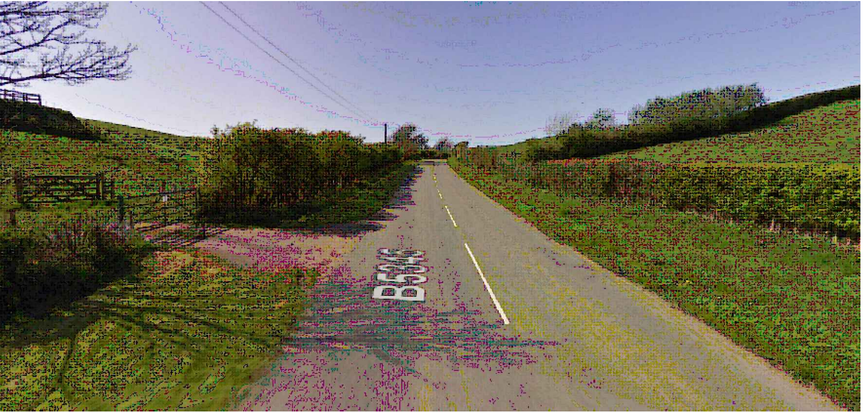
P1 - Visibility of access road facing Northwest.