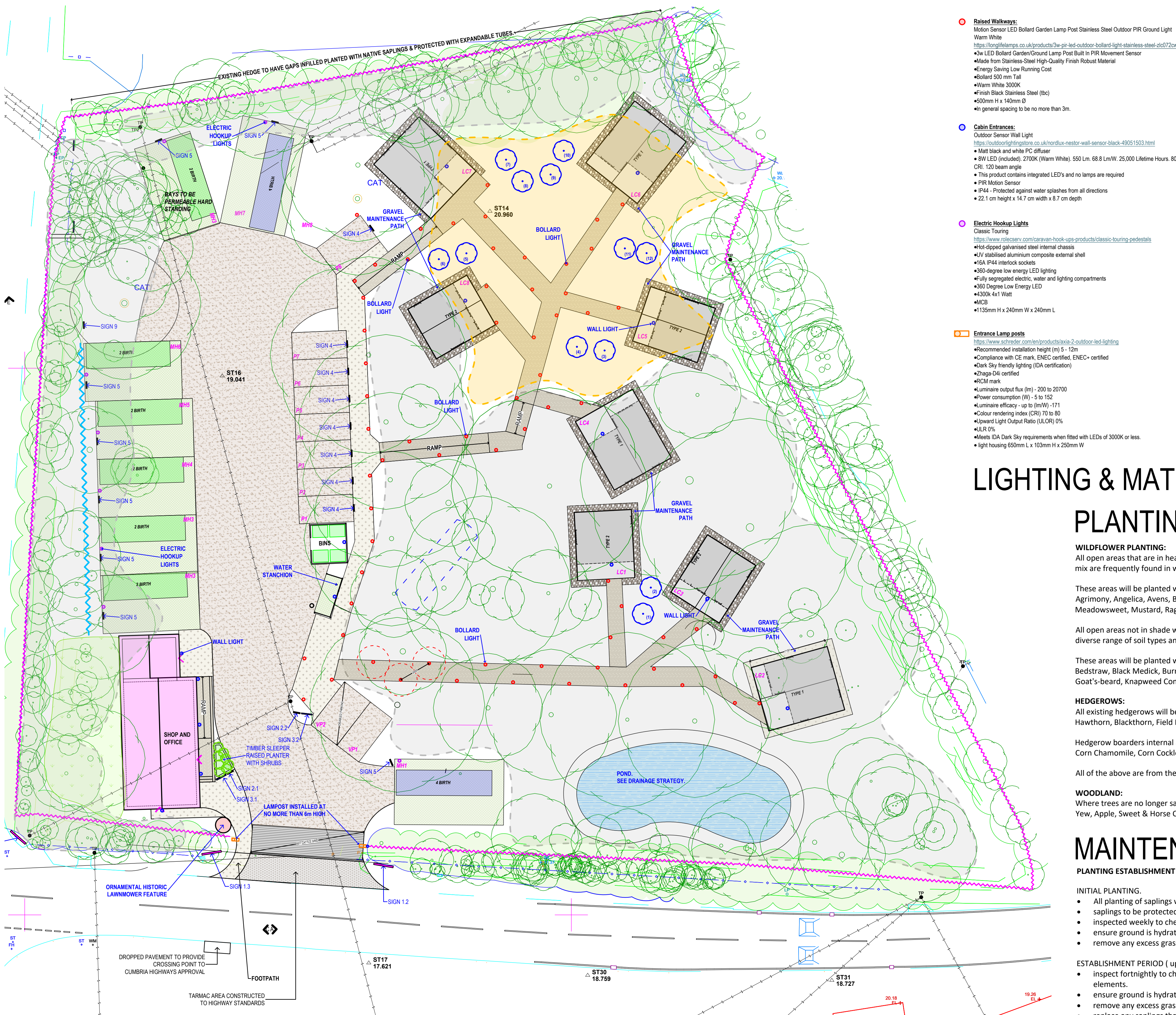
PROPOSED LIGHTING & LANDSCAPING PLAN