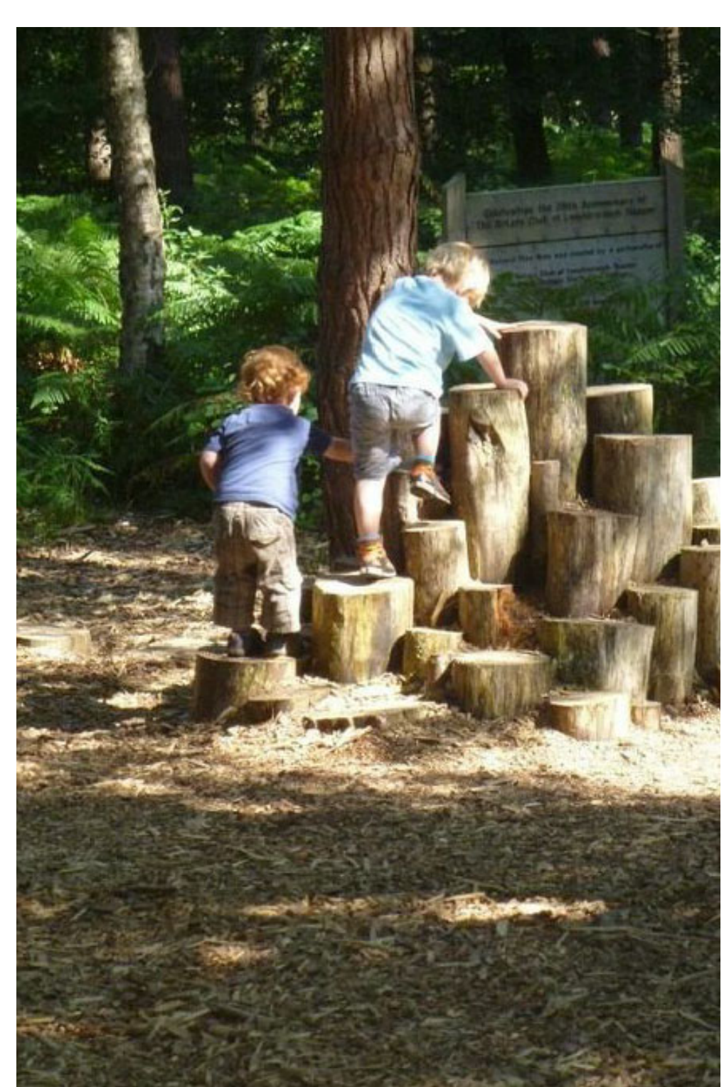
Illustrative example of natural, informal play