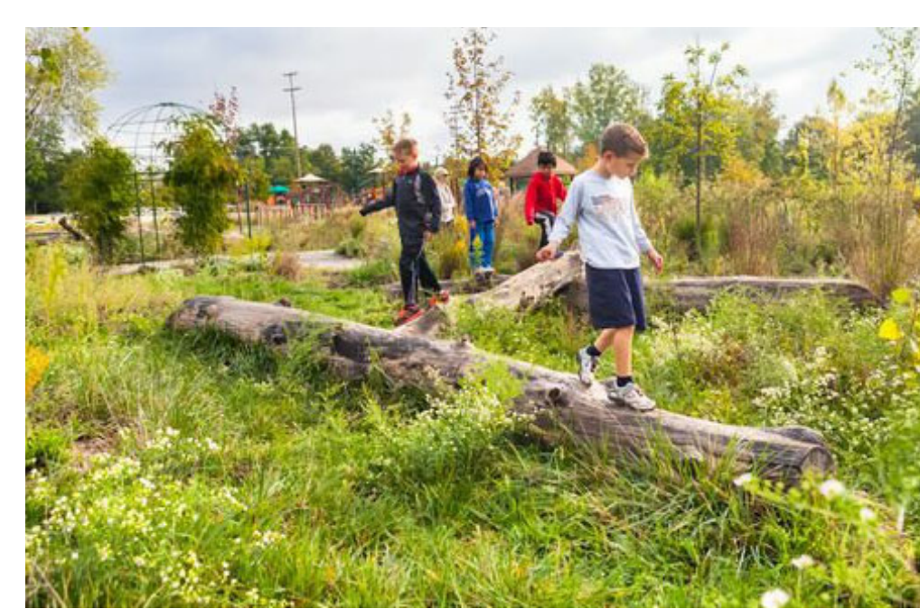
Illustrative example of natural, informal play