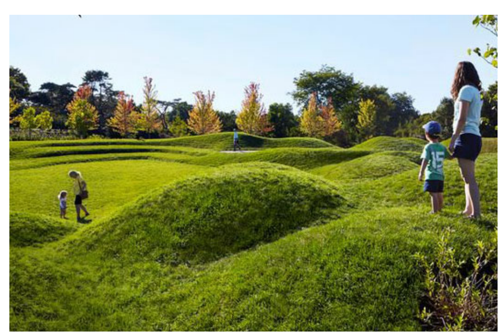
Illustrative example of earth mounding