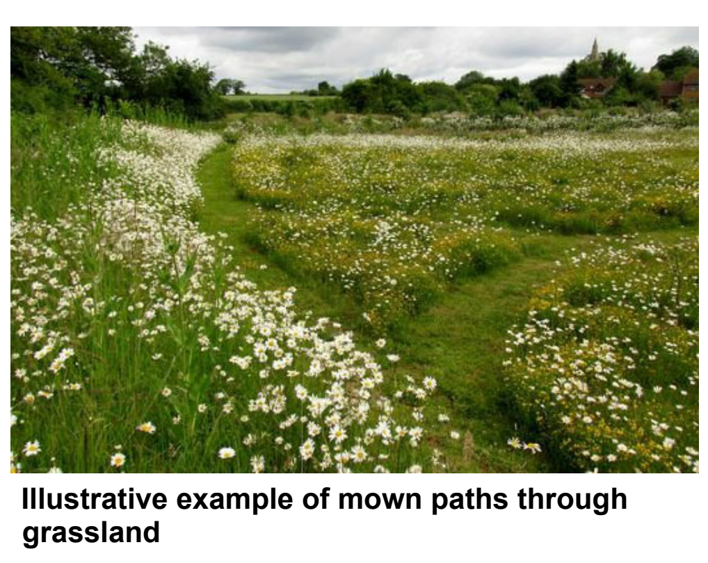
Illustrative example of mown paths through grassland