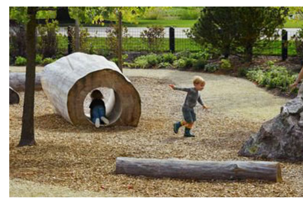
Illustrative example of natural, informal play