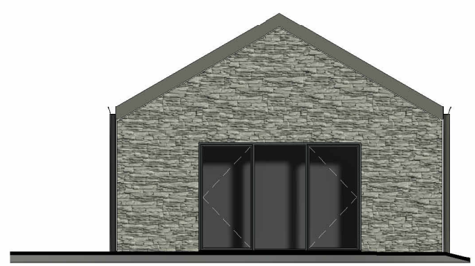
3 Garage Side Elevation 1 : 100