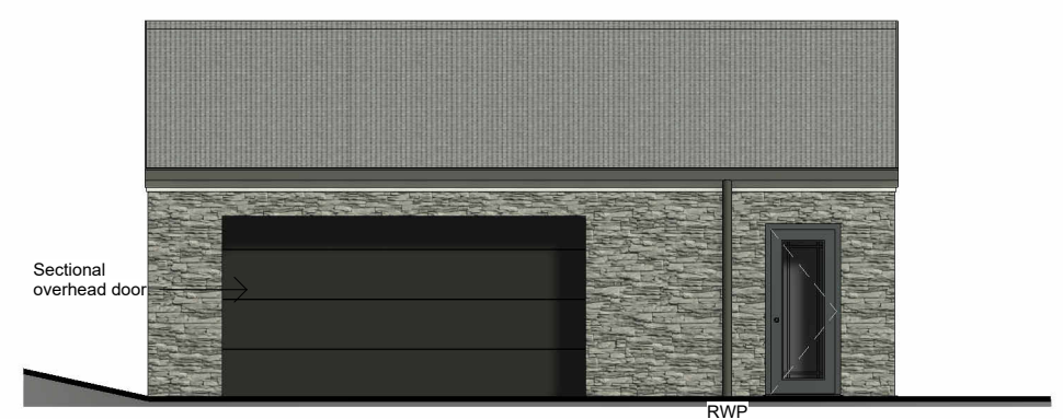
2 Garage Front Elevation 1 : 100