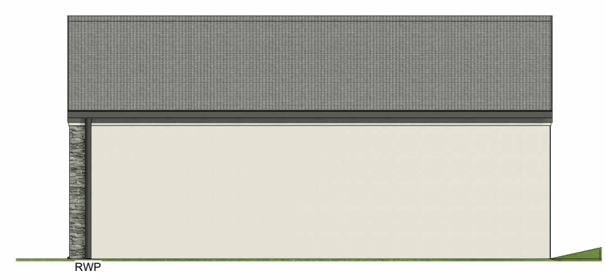
4 Garage Rear Elevation 1 : 100