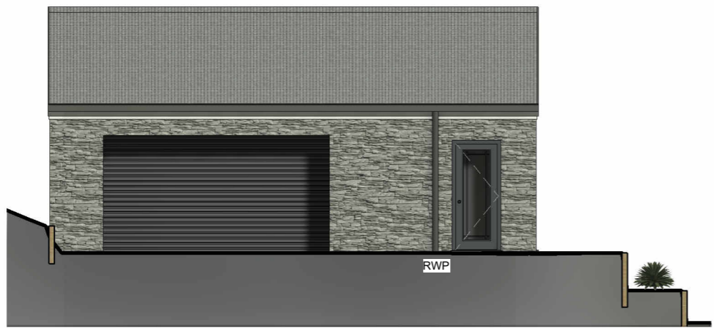
2 Garage Front Elevation 1 : 100