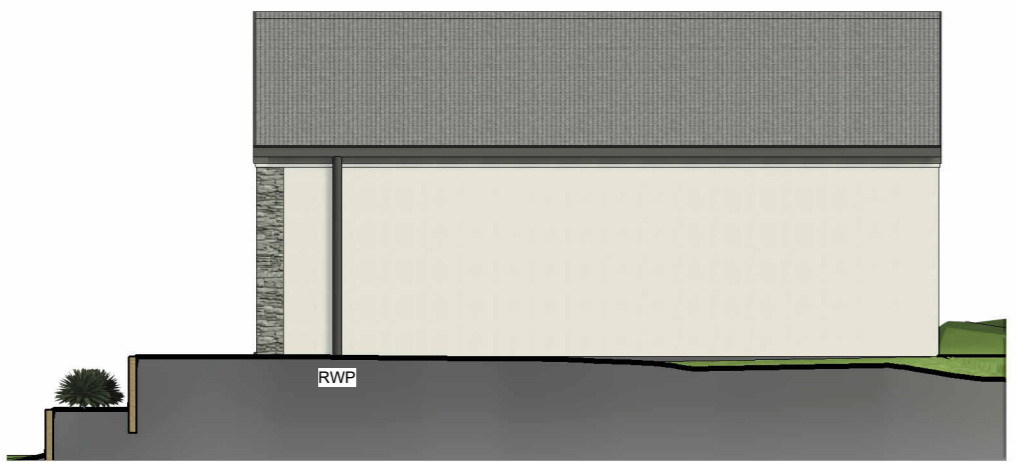
4 Garage Rear Elevation 1 : 100