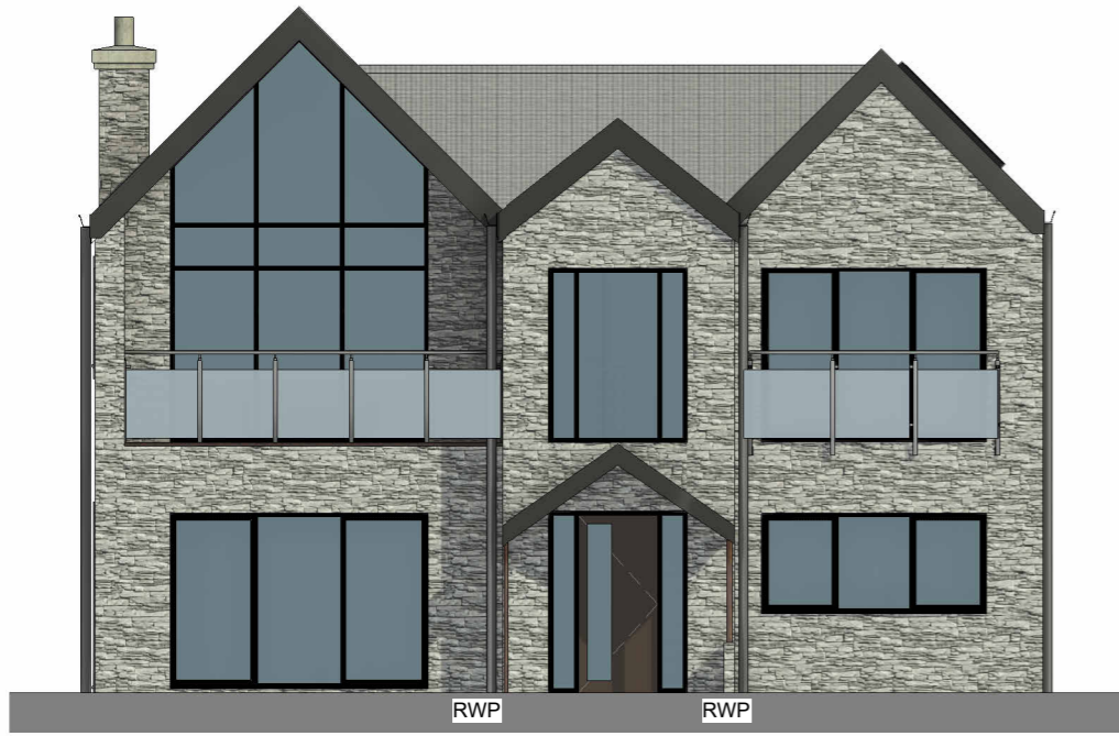
1 South Elevation 1 : 100