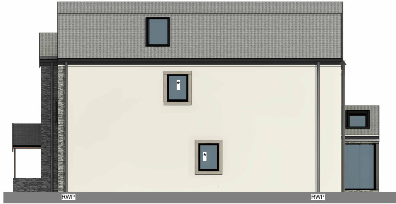
2 East Elevation 1 : 100