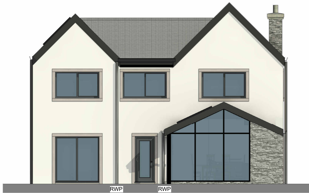
3 North Elevation 1 : 100