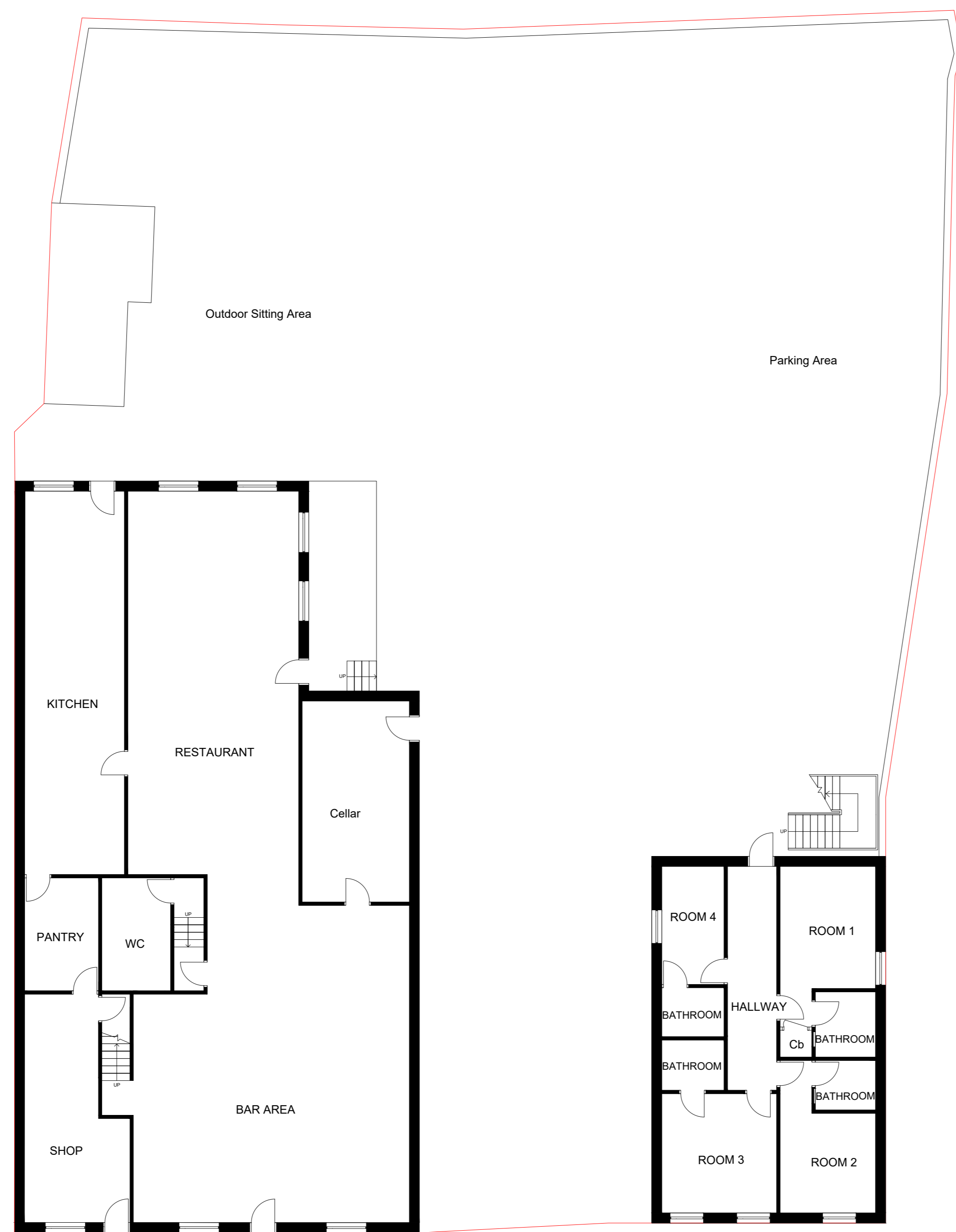
Existing Ground Floor Plan