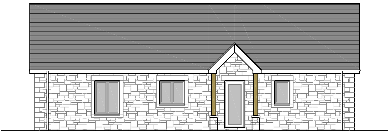
SIDE ELEVATION (PLOTS 9 & 21 ONLY)