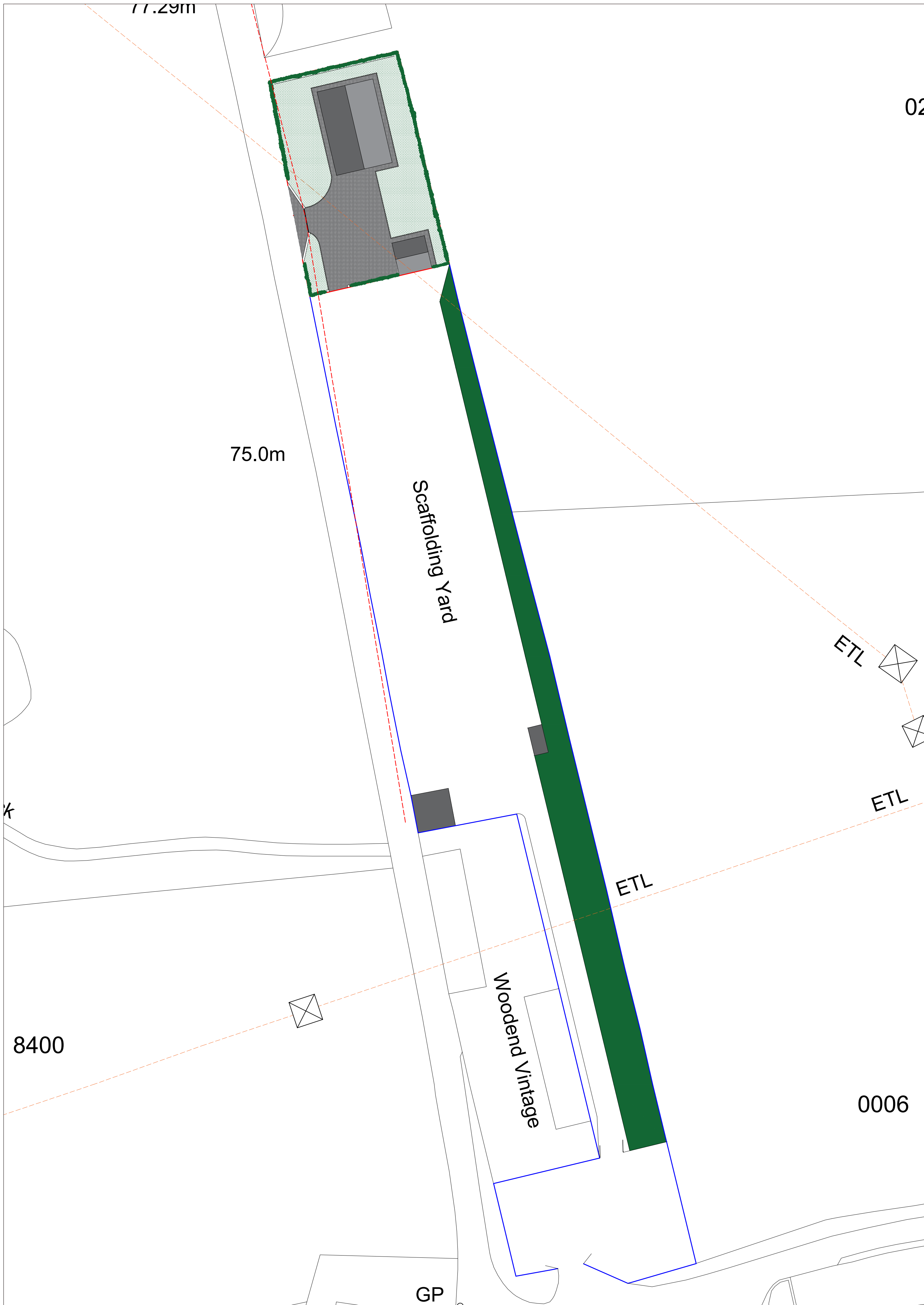
Block Plan 1/500