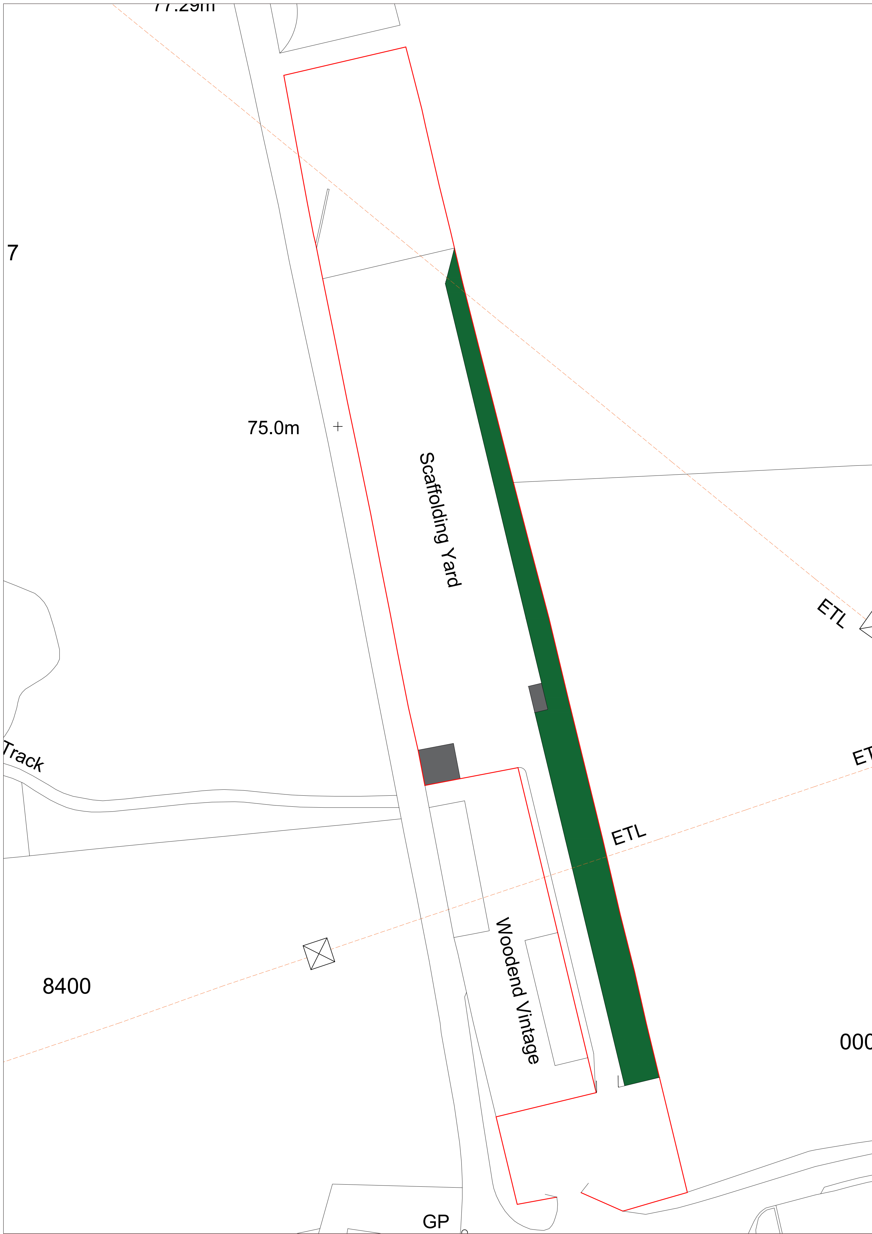
Block Plan 1/500