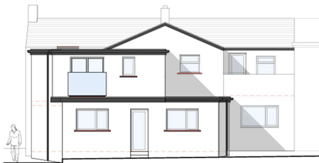
West Elevation 1:100 Scale