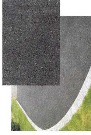
Access Road & Associated Pavement - Tarmac