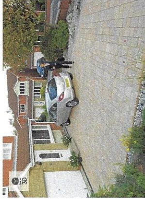
Driveways - Tegula Paving, Marshalls