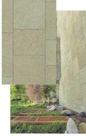
Patios - Capleton® Pavers, Marshall colour Grange 310x110mm or similar