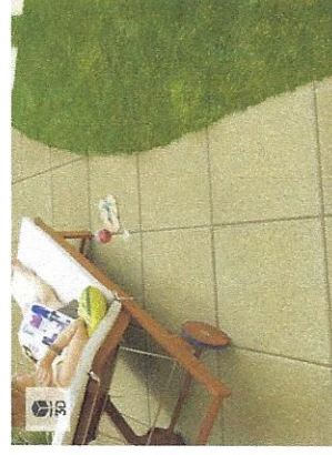
Paths and Front Patios - Perfecta Paving, Marshalls