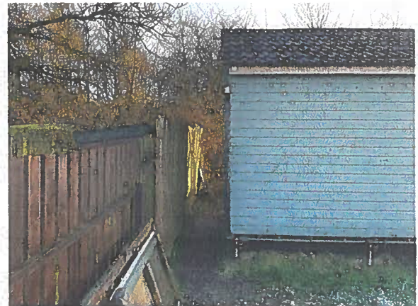
West and East Boundary separation from building.