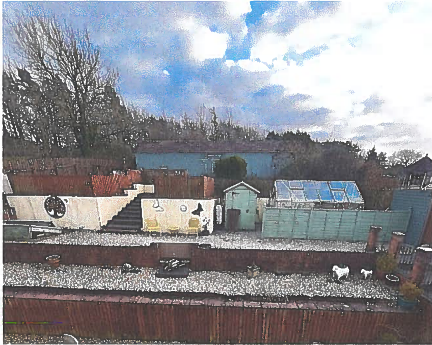
View from 1 st Floor