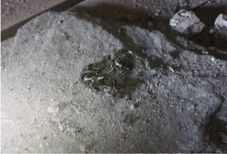
Old owl pellet on scaffold boards.