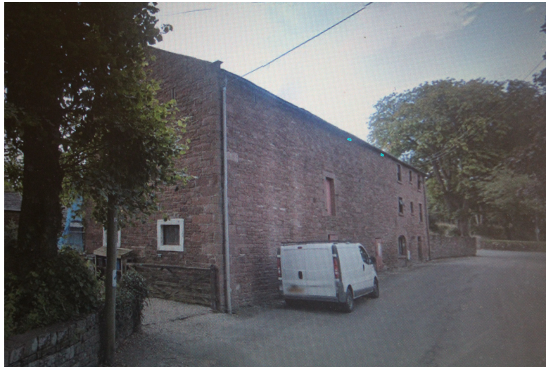
View from the north with bat & swallow access