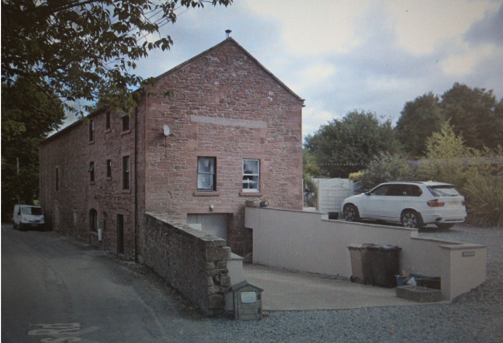
Barn viewed from the southwest