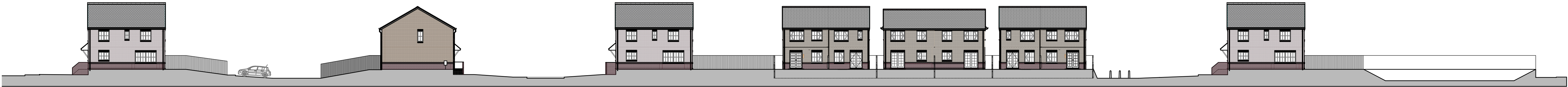
STREETSCENE A-A (VIEW ALONG EXISTING CYCLE PATH)