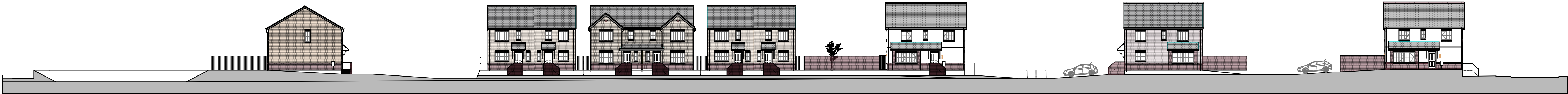
STREETSCENE C-C (VIEW ALONG NEW DEVELOPMENT ACCESS ROAD)