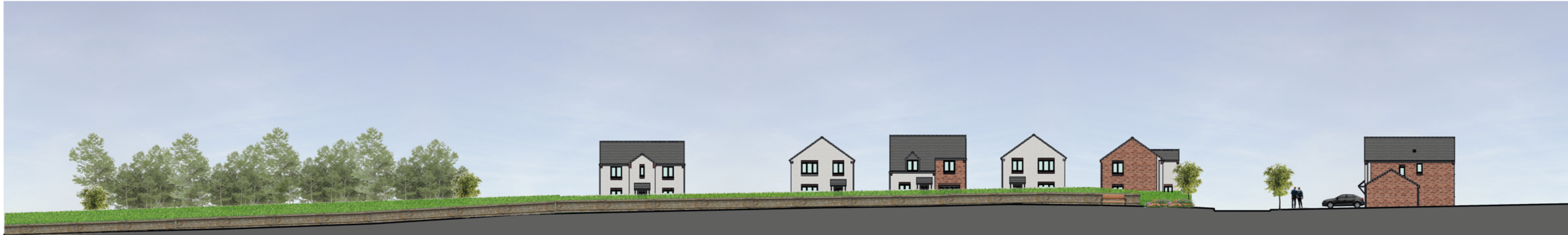
PROPOSED STREET SCENE 2