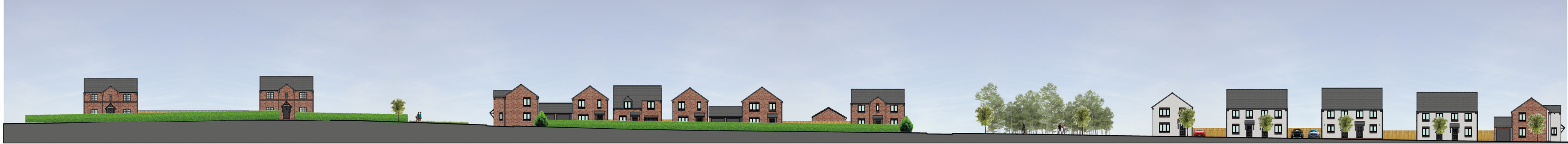
PROPOSED STREET SCENE 1