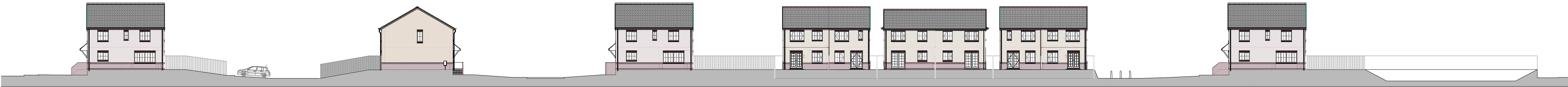
STREETSCENE A-A (VIEW ALONG EXISTING CYCLE PATH)