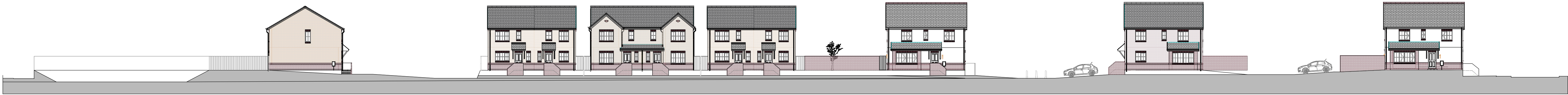
STREETSCENE C-C (VIEW ALONG NEW DEVELOPMENT ACCESS ROAD)