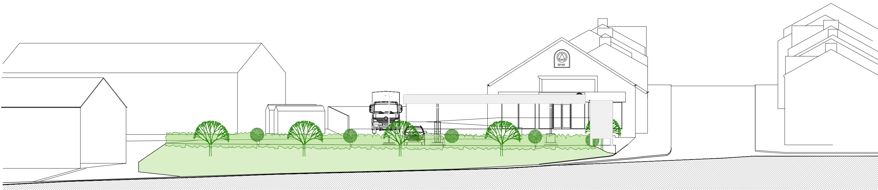
MILL STREET ELEVATION

Notes: Do not scale from this drawing. This drawing is to be read in conjunction with all relevant design team specifications and drawings. All dimensions are to be checked on site prior to commencement of work any variations to be notified to the Project Architect. All components and materials are to be stored, protected, handled and installed in accordance with the manufacturer's recommendations. © Harry Walters & Livesey Ltd