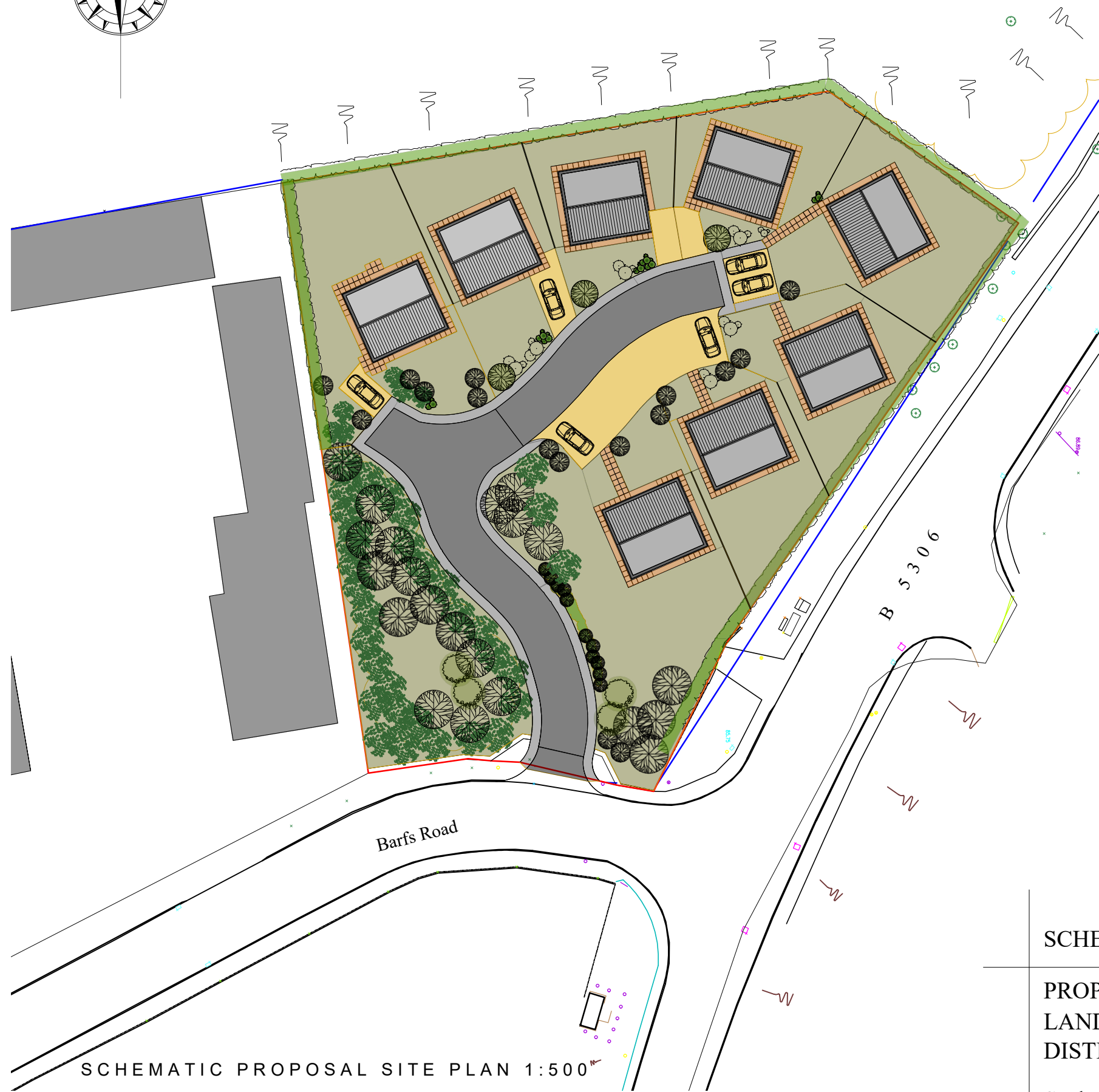
SCHEMATIC PROPOSAL SITE PLAN 1:500

Schematic proposal for 8 dwellings with access & parking arrangements