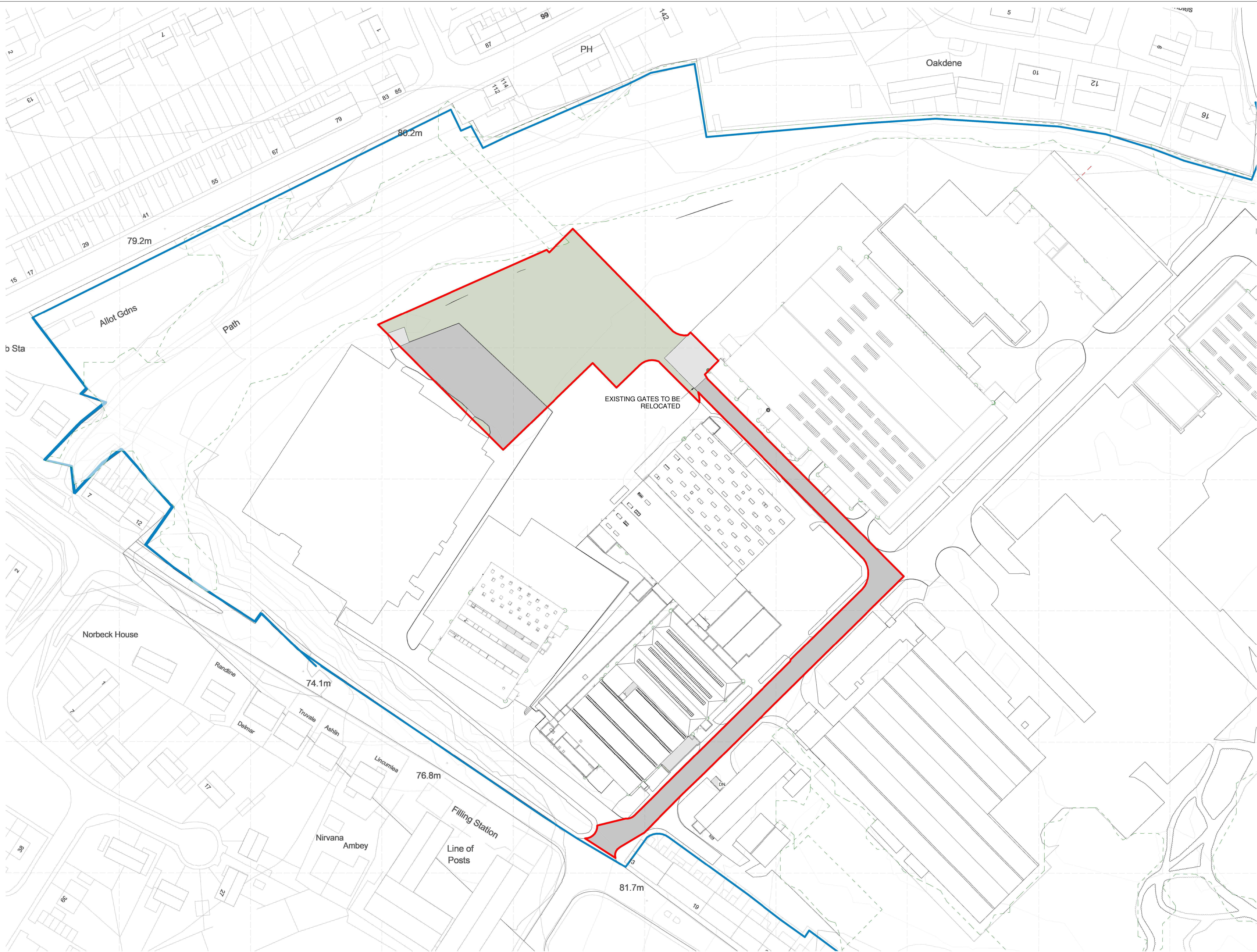
EXISTING PLAN SCALE: 1 : 500