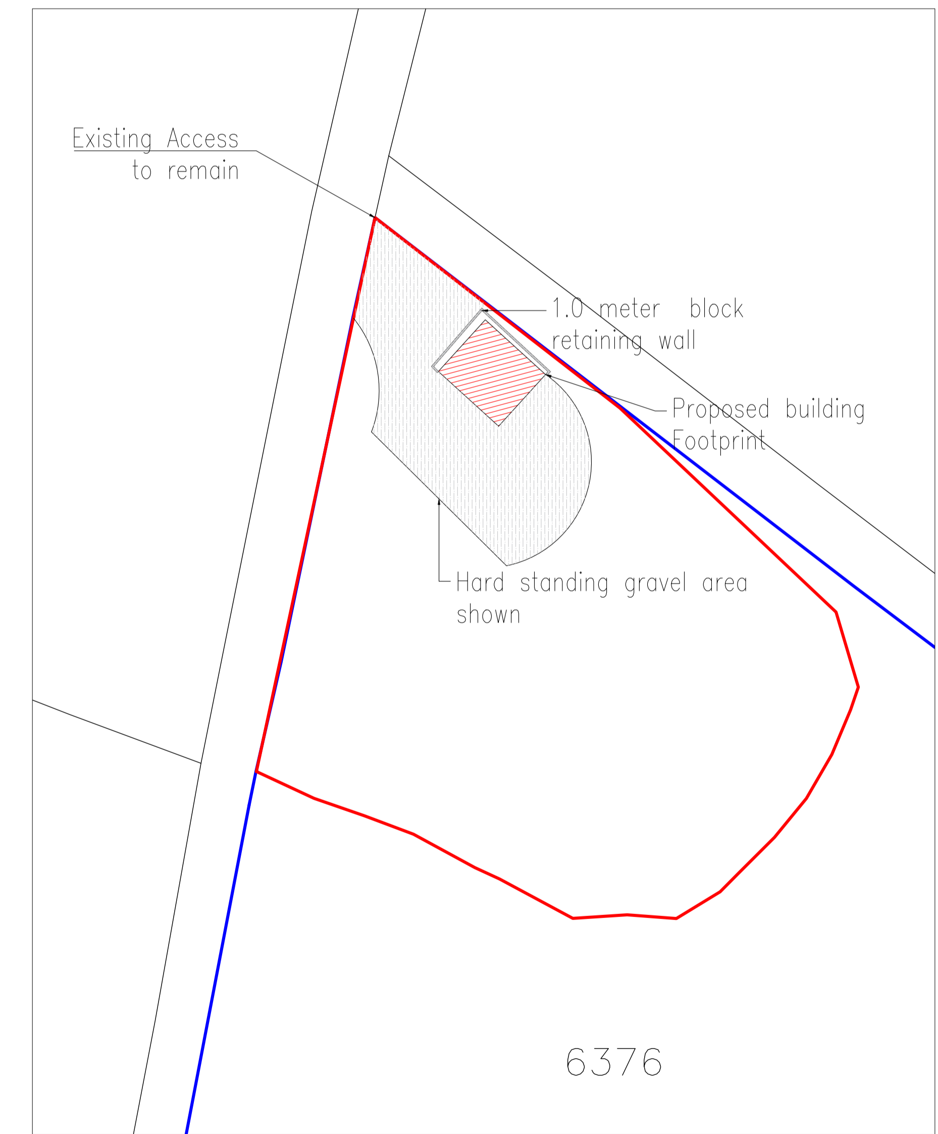
Proposed Block plan Scale 1/500