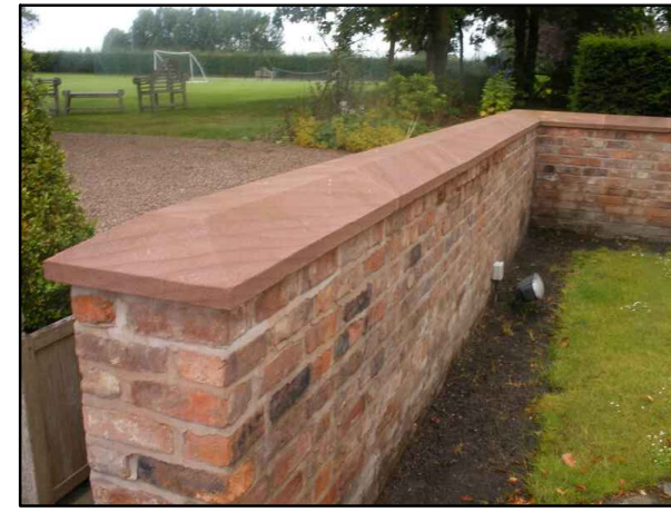
Sandstone Capping Stone